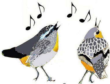
The Singing Birds

Questions? Please email: k.urbschat@gmail.com