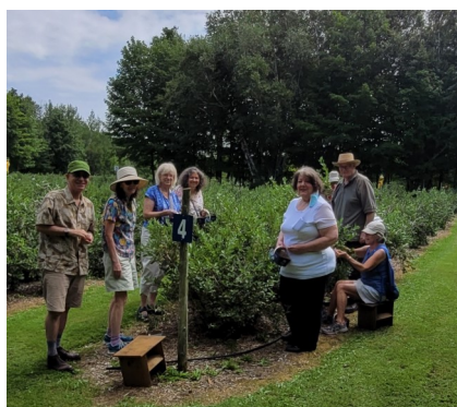
Picking blueberries and picnicking in St. Nicholas.