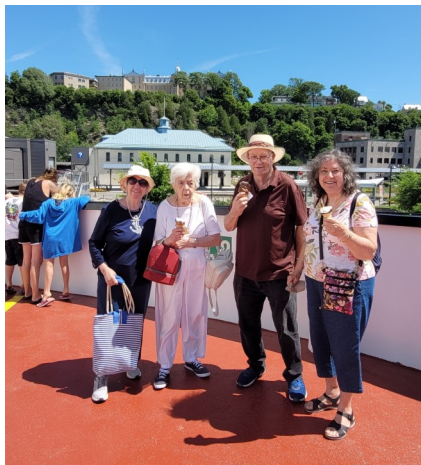
Taking the ferry to Lévis' Quai Paquet on a sunny day.