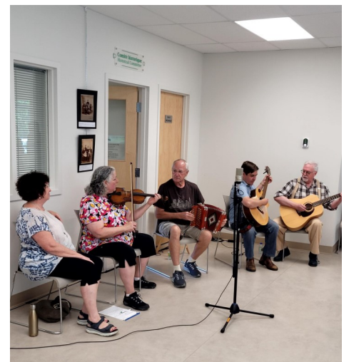
Aug 20—Musicians at Heritage event.