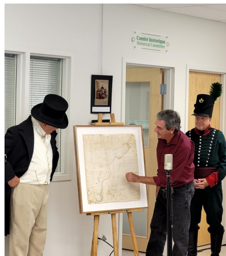
Aug 20—Unveiling of historic 19th century map.

You can also join us for our monthly Community & Coffee Chat , or In Stitches meetings, which are drop-in activities!