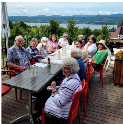
Île d'Orléans visit, followed by lunch with a view.

Out & About participants have been busy hopping on buses and enjoying the warm summer months filled with music, site visits, delicious food and taking advantage of the little pleasures of life!