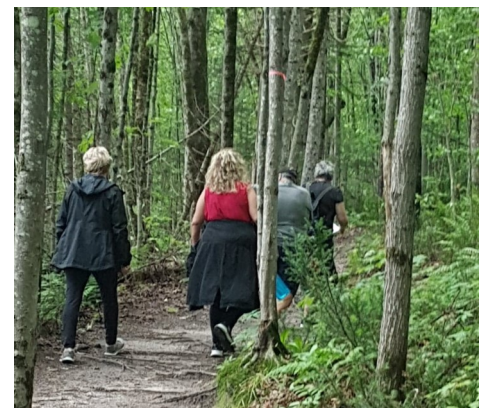
Walking Distance participants getting in their daily steps!