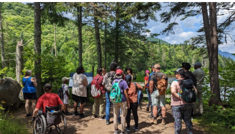
A guided tour discovering the amazing Jacques-Cartier National Park.