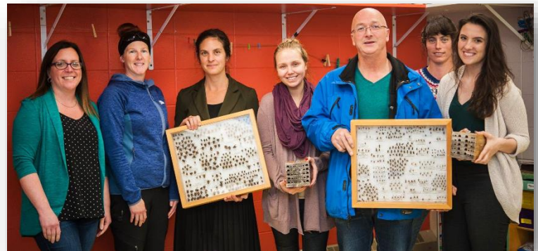
Introduction to Bee farming (Apiculture) on the Lower North Shore!