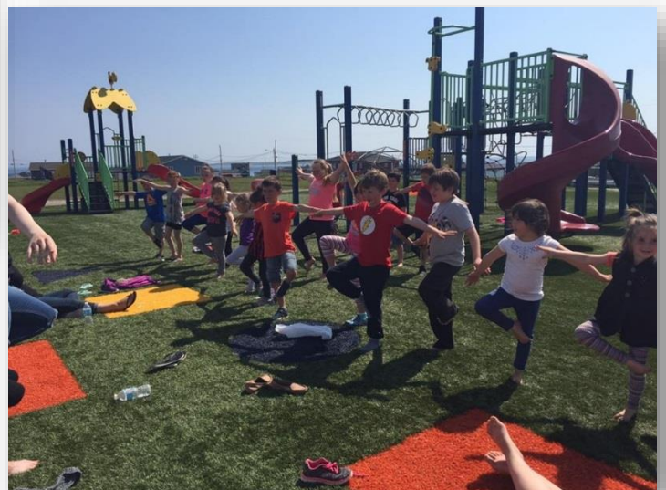
KIDS Summer Camp activities!