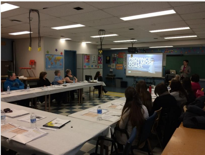
Coasters AGM event!

All these goals are important, but the last one is particularly vital, not only for the organization but also for the people that the association serves. Being prepared in a context where government resources are under pressure and social, economic and technological change is the rule rather than the exception is an essential element for community development. Through the development of a strategic vision and plan, Coasters Association has laid the foundation to ensure that the Lower North Shore region will be able to continue the process of revitalization and make certain that the future for its communities will be sustainable.