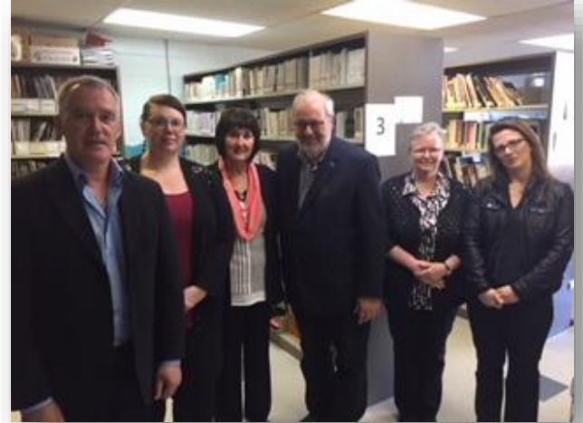
Honorable Pierre Arcand visits the Lower North Shore

This remote region, which is majority English-speaking, has witnessed a significant decline in population over the last few decades due to the collapse of the region's main economic activity (the cod & salmon fishery), and the decline in the snow crab fishery. It is estimated that approximately half of the region's adult population leaves the Coast at some time during the year to secure employment elsewhere. Many leave the territory for several months at a time while their family remains on the Lower North Shore which results in social dislocation as, in some cases, both parents leave for work and their children are housed with grandparents or other family members. Many social challenges have emerged from the changing circumstances, such as caring for the elderly, and many youth leave and do not return due to the lack of job opportunities.