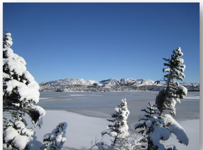
Some of our fantastic coastal scenery!

The Coasters Association's objective is to make the Lower North Shore a better place to live for residents of the Coast and we firmly believe that this objective will be attained sooner if everyone gets involved. By linking the communities of the Coast and by giving them a chance to partake in joint initiatives, the Coasters Association aims to create a common bond that will enable the entire Lower North Shore to face the challenges of renewal and development as one.