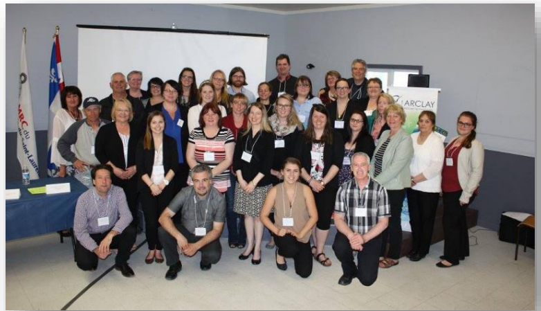
Lower North Shore Scientific Summit!