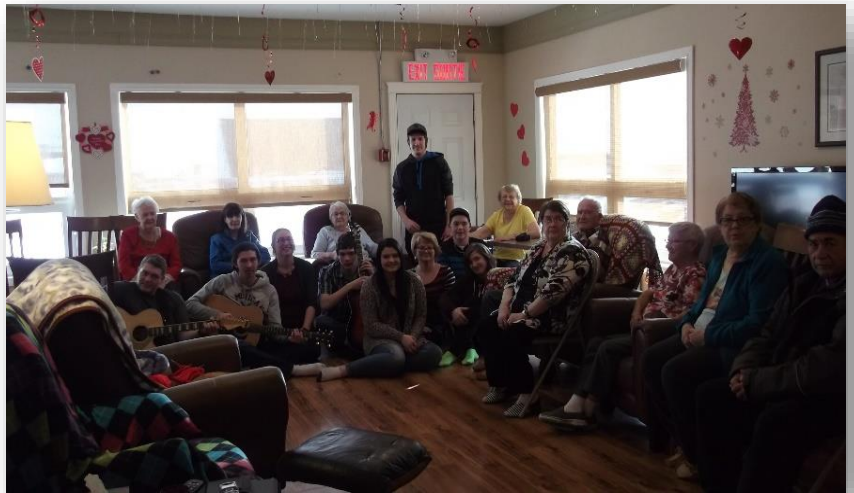
Intergenerational activity with seniors and youth at Residence aux Beaux Sejours!

By identifying overall objectives and initiate partnership actions in collaboration with social services and health networks