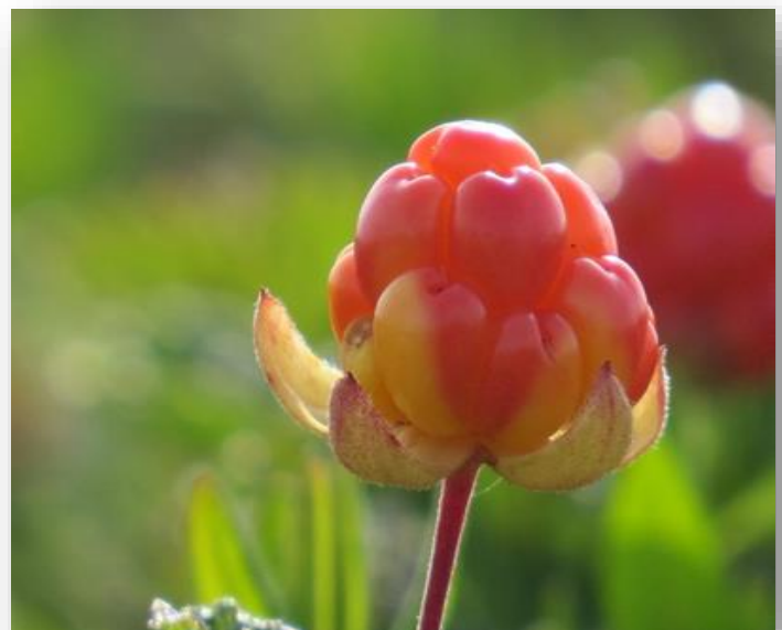
Our famous bakeapple!