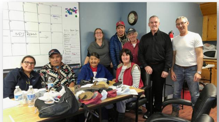
Visit from representatives of the Native Community!