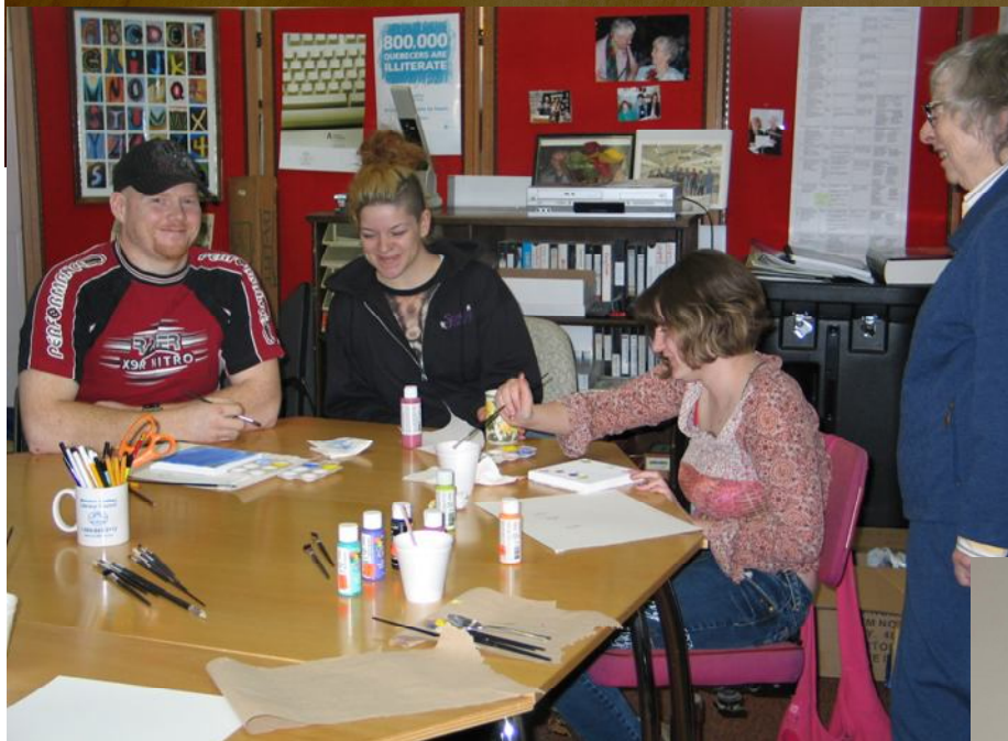
Art work created by W.Q. Literacy Council students and volunteers for Adult Learners' Week 2014 (SQAF)