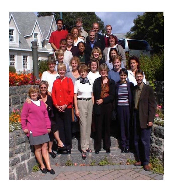
Holland Centre Staff 2001

Holland Centre continues to look for opportunities to expand its ability to serve the community. For example, Holland Centre is currently involved in creating intermediary housing for seniors in the English-speaking community. This housing project would provide a means for seniors to remain independent within the community in a secure and culturally-appropriate environment.