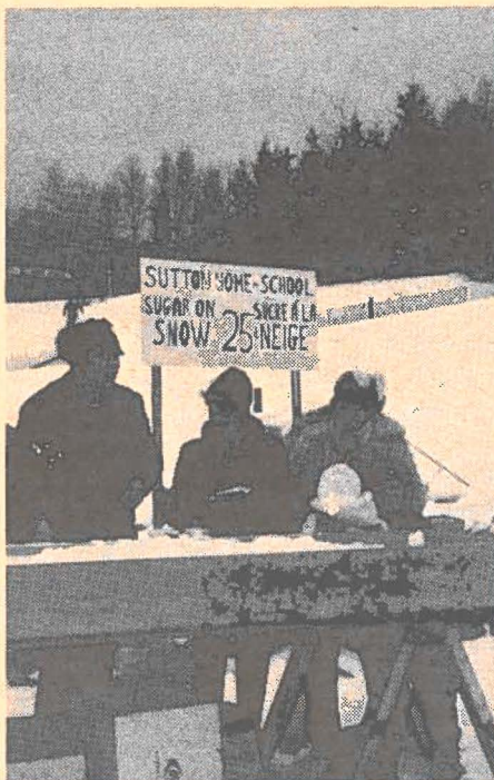
Members of Sutton Home & School Association combine skiing and sugaring-off at the Mount Sutton Ski Centre.

With this issue, the "From the locals" column disappears until next Fall.