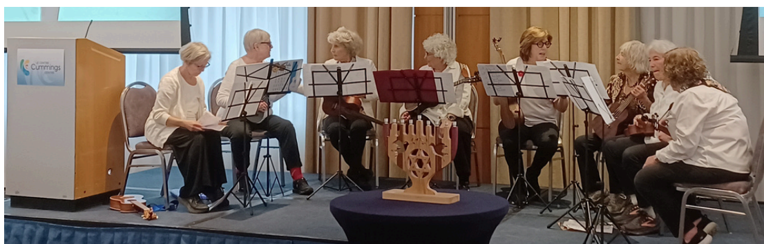
Group of ukulele students jamming it out at the Cummings Centre Open House

We were delighted to get an invite to attend an Open House at the Cummings Centre, where we were able to learn so much more about this organization, one of the participants in the One Voice Coalition.