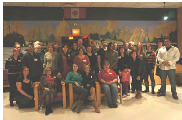
Taste of Québec Meet & Greet March 2013