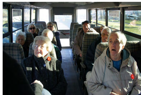
Seniors on the bus waiting to return home after Seniors Day.

This project provides English-speaking seniors with free transportation on a weekly basis to community activities and outings. The objective of this program is to reduce isolation of seniors in our community while helping them to continue to live autonomously. There were 43 outings with approximately 350 participants the past year which included lunches out, shopping trips, restaurants, community events, movie matinees and visits to local spots such as Île d'Orléans.