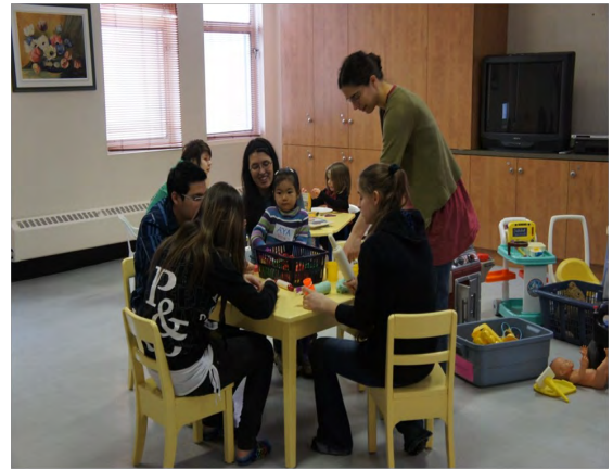
The play dough table is always a favourite with participating children.