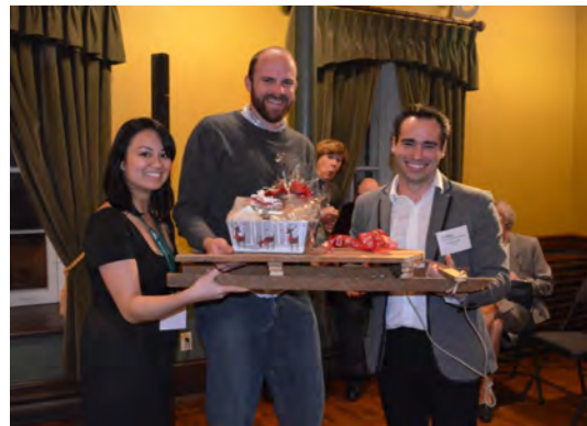
Happy Holiday Hour December 2012

VEQ distributed more than 200 newcomer's packages with the help of supportive community partners such as Jeffery Hale Community Services, Valcartier Family Centre, Jeune et en santé and the various schools and churches in our community.