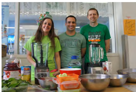
St. Patrick's High School Irish Olympics

In order to spice up the St. Patrick's parade, the student council in St. Patrick's High school held a relay race with different obstacles called the Irish Olympics. BAQ took part of this very entertaining race by hosting one of the stations. When the students got to BAQ's table, they