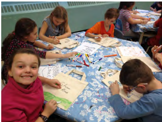
Art for All at Everest Elementary

The first component consisted of a series of after school art classes for kids. A total of 6 elementary schools participated in the classes. Each school hosted 8 different artistic sessions and 144 kids participated in the classes. Many exciting arts and crafts projects were completed in a variety of different artistic mediums. These projects included making tissue paper night lights, decorating wooden tissue boxes, modeling clay magnets, painting flower pots, making edible art with BAQ, colouring with fabric markers onto canvas bags, painting and