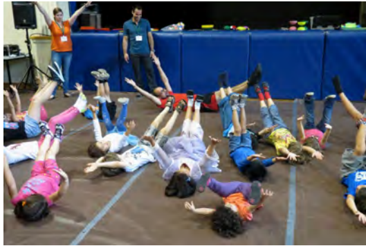
Circus Class—Fall Fest 2012