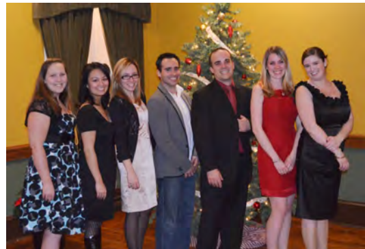
VEQ staff at Holiday Happy Hour 2012

Centre in Old Québec. Over 125 community members spent the evening socializing with friends old and new while partaking in the abundance of refreshments and merry entertainment. This year, 15 local businesses that serve our English-speaking community donated generously towards 4 large door prizes that were drawn to those in attendance. VEQ would also like to give a warm thank you to all the local businesses who graciously donated to the door prizes, as well as the community members in attendance. We could not have asked for a better way to ring in the Holidays.