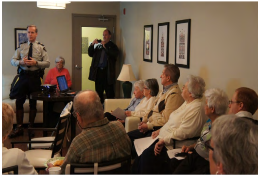
McGreevy Manor residents listening to the Workshop on Mass Marketing Fraud presented by the R.C.M.P.