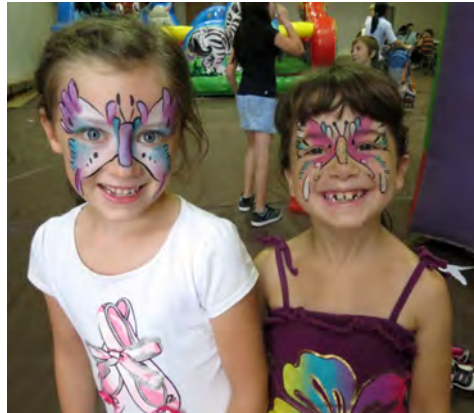
Fall Fest 2012

Thanks to our partnerships with Citizenship and Immigration Canada, Jeffery Hale Community Partners, Department of Canadian Heritage and the Ville de Québec, hundreds of community members joined VEQ on