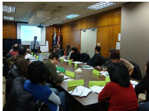
Entrepreneur Workshop with YES

Finally, we organized a third professional networking event in October 2012 called the Bilingual Job Fair . Over 120 jobseekers and 22 employers of the Quebec City region participated in this successful event.