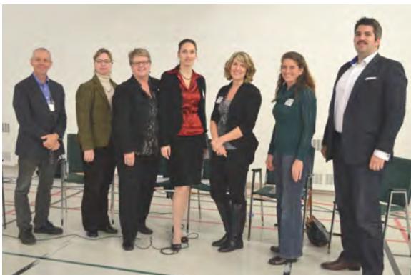
Moderators, Future Forum 2012

Due to our collaborations, ESC organizations are able to work together to find solutions, increase funding for local initiatives and share resources to better serve our linguistic community.