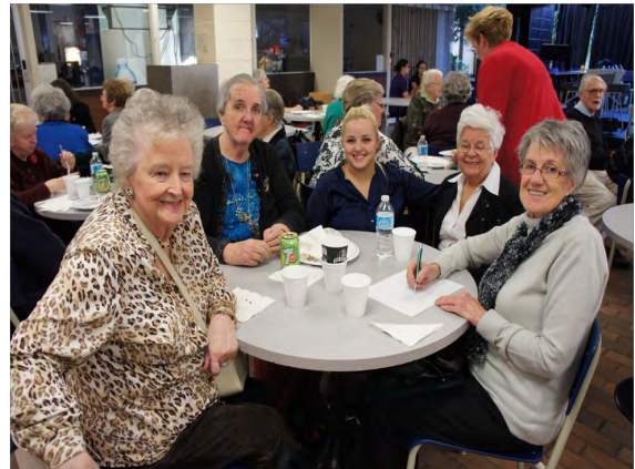
Seniors having lunch and enjoying the entertainment provided.