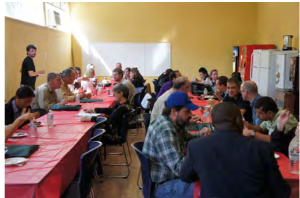
Employability Workshops September 2012