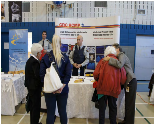
Seniors stopping by the R.C.M.P.'s booth to get information on Elder Abuse.

On Saturday, November 10, 2012 VEQ launched a new initiative called Seniors at the Heart of Our Community which was an information fair on aging in the Greater Quebec City region. Over 70 seniors, caregivers and family members came out to the event. The fair was held at CEGEP St. Lawrence, where the gym was set-up with 18 booths of community groups and businesses that cater their activities/services towards seniors.