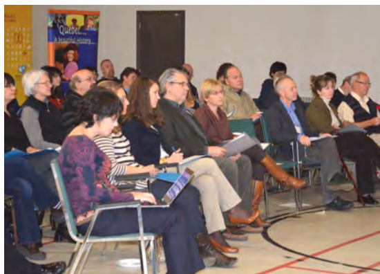
Community members gather for the presentations

"Very well organized, topics for discussion were productive. It is a very clever initiative and one that deserves to be repeated so as to maintain this momentum. What's next?"