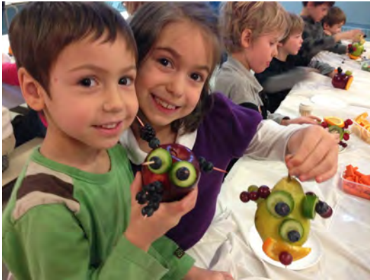
After School Art Project 2012

BAQ and the Art for All, All for Art Project provided a very fun after-school activity of food sculpturing, using a variety of fruit and veggies. The idea behind this activity was to raise awareness of healthy snacks. Our initiative was able to repeat the experience, which was very successful, with many schools in the Central Québec School Board.