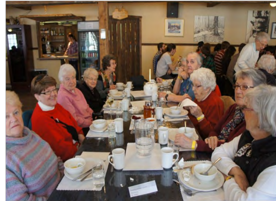
Seniors enjoying lunch at the Sugar Shack.

examples of the different types of elder abuse, these videos can be seen on the VEQ website. VEQ in partnership with the R.C.M.P spoke to 103 seniors from 7 different groups around the region about the various forms of abuse that they may experience as well as spoke about the services available to seniors.