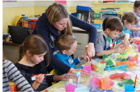
Art for All at Valcartier Elementary

decorating canvases, folding kite paper stars, painting with ceramic paint on plates and bowls, painting wooden shapes and making Christmas decorations.