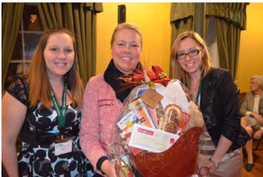
Holiday Happy Hour 2012

A huge thank you from VEQ to everyone who participated in Fall Fest 2012!