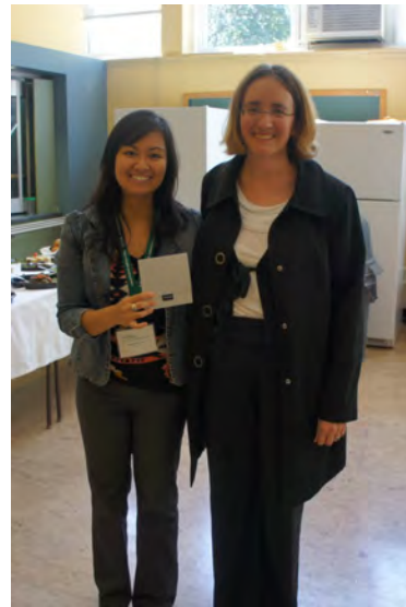
Employability Workshops September 2012