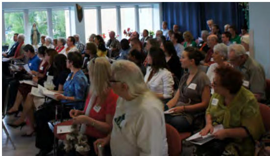
Annual General Meeting 2012

The AGM was held on May 31, 2012 in the Coin Soleil Room of the Jeffery Hale Hospital. Over 110 people joined us to hear about activities from the previous year as well as exciting new initiatives. Elections for Board Members took place and the community selected 10 new Board Members from a list of 14 possible candidates.