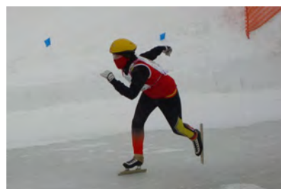
Skating Portion of Pentathlon 2013

BAQ partnered with 2 school teams for a most spectacular winter event: Le Pentathlon des Neiges. The Pentathlon included the competitive practice of 5 sports: skating, cross country skiing, running, snow shoeing and biking. Holland Elementary and St. Patrick's High school represented their schools with pride on February 28, 2013.