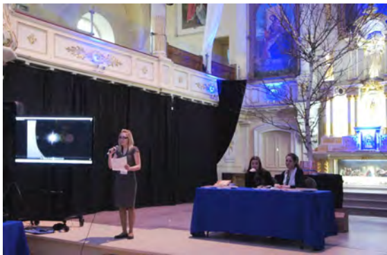
Quebec City Memoirs Book Launch

Memoirs of the English-speaking community: Bridging generations in Quebec City and the Chaudières-Appalaches region is a compilation of the memories of our seniors as recounted and written by youth in this memorable experience of bridging the stories of the past to the present for all generations to share.