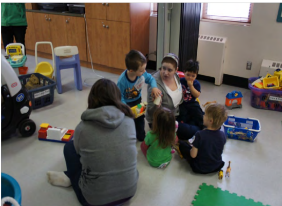
Participating children, VEQ staff and a volunteer during a Take-a-Break morning.

VEQ coordinated the volunteer Income Tax program for low-income English-speaking individuals and families. Volunteers who enjoyed working with numbers and taxes received training and access to tax software free of charge and then worked hard to complete tax files for the 2012 tax year. The coordinator worked with the client and social worker to make sure that the volunteers had the all the appropriate information so the client received the government benefits to which they were entitled. Over 20 tax files were completed during this year's program.