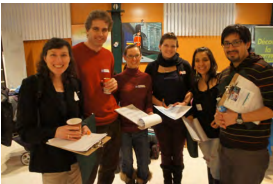
French For All Forum February 2013