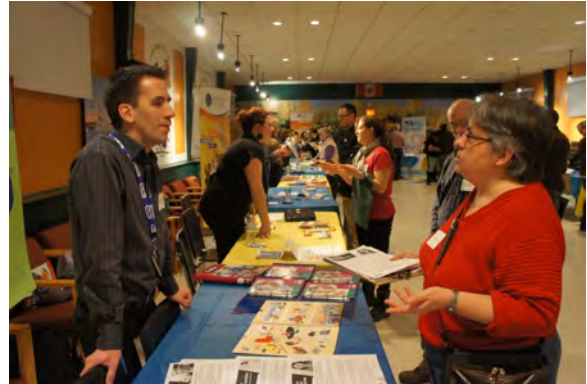
French For All Forum February 2013

VEQ was able to offer once again the Night-goers initiative. Night-goers are social night activities for the English-speaking community. It is comprised of volunteers and it is actively recruiting throughout the year. As of April 2013, Night-goers hosts and hostesses have provided 30 social night activities and events. In total, 219 participants have attended Night-goers events.