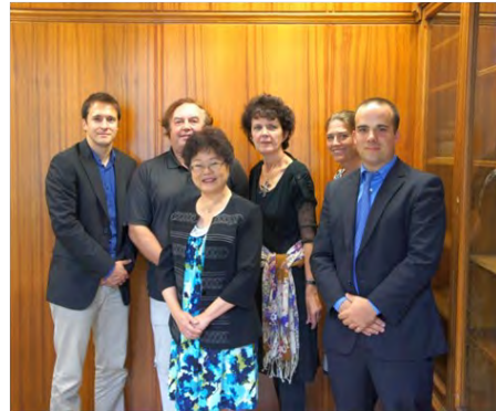
VEQ meeting with the Honourable Alice Wong, Federal Minister of State (Seniors)