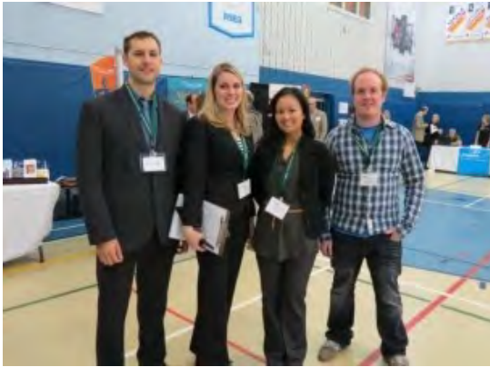
Job Fair 2012

wholesale distribution, tour guide services, civil engineering consulting, construction, event organization, resource management consulting, health and social services consulting, professional photography and 3D Art firm.