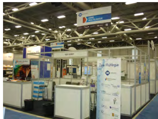
Foire de l'Emploi 2012

Our regular work with newcomers and other community members made us realize that there was a crucial lack of services for English-speaking jobseekers and entrepreneurs in our region. Consequently, over the last two years, we developed this project that directly helps English-speakers find meaningful employment or create their own business.