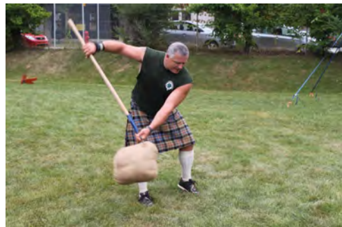
Fall Fest 2012

Saturday, September 8, 2012 for the Annual Fall Fest at Quebec High School. The indecisive weather brought some of the activities indoors but that didn't stop a great crowd of over 600 people from enjoying the celebrations. Activities for all ages as well as inflatable games for the kids, a circus workshop through l'Ecole de Cirque Québec , face painting and more were provided. Through a partnership with the Quebec Celtic Festival, the event also included Highland Games demonstrations, refreshments and a Celtic Football game on the field.