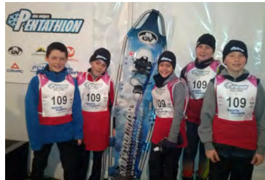
Holland Elementary Pentathlon 2013

were asked to make a smoothie with a variety of ingredients provided by BAQ. A panel of judges tasted each smoothie and attributed points to each team. Being part of this relay allowed BAQ to give some healthy eating tips through the creative process of helping kids create smoothie recipes. The entire school was involved in the project. The students were very enthusiastic and showed interest in the healthy eating aspect of the event.