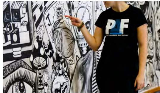
Mural painted at PAF

The Performing Arts Festival (PAF) took place on Friday, March 22, 2013. 7 high schools from across the CQSB came to Quebec High School to start the day. The students participated in an art workshop of their choice during the morning. The workshops included mural painting, circus, trapeze, beat boxing, hip hop dancing, song writing, African drumming, magic, record disc scratching, hip hop performance, spoken word, and improv. In the afternoon once workshops were completed, the students took a