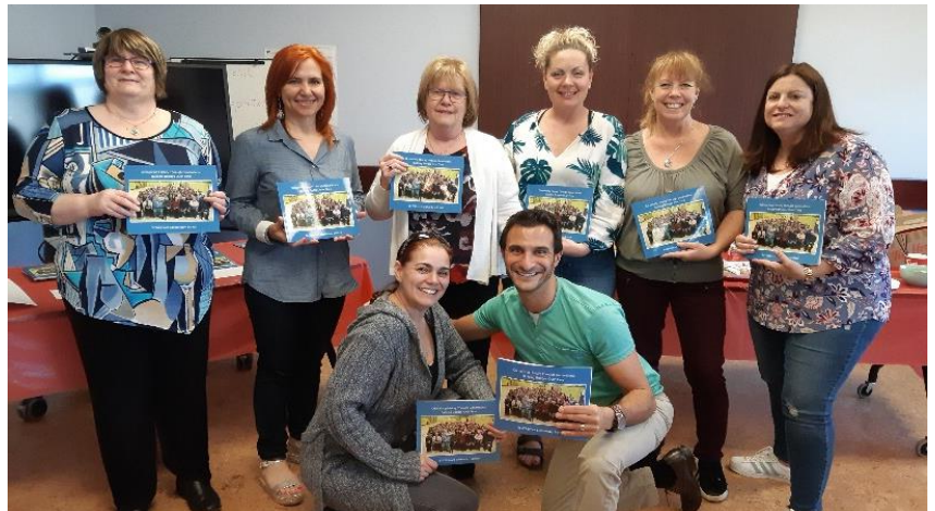
Photo of our book distribution at St. Willibrord with all the teachers and staff who helped us. A big thank you again for all your help.

Students and staff from St. Willibrord teamed up with the seniors of the MWCN to collect stories and memories to be published in a book. Everyone enjoyed the sharing and working together.