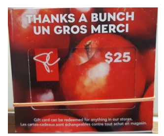
Gift cards with $25 value