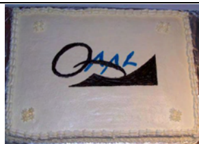
Congratulations QAAL on your 25 th Anniversary

QAAL, former Board member /current member