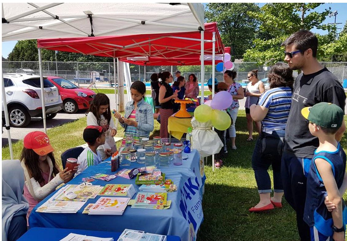
19 area organisations took part in Community Fun Day and presented their activities and resources.