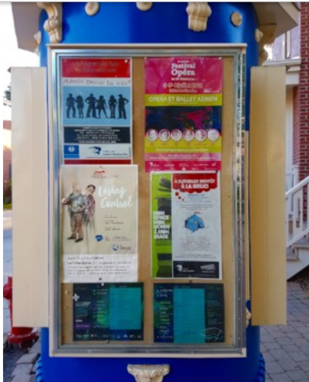
Losing Control was presented at the Petite église in Saint-Eustache. A moving play.