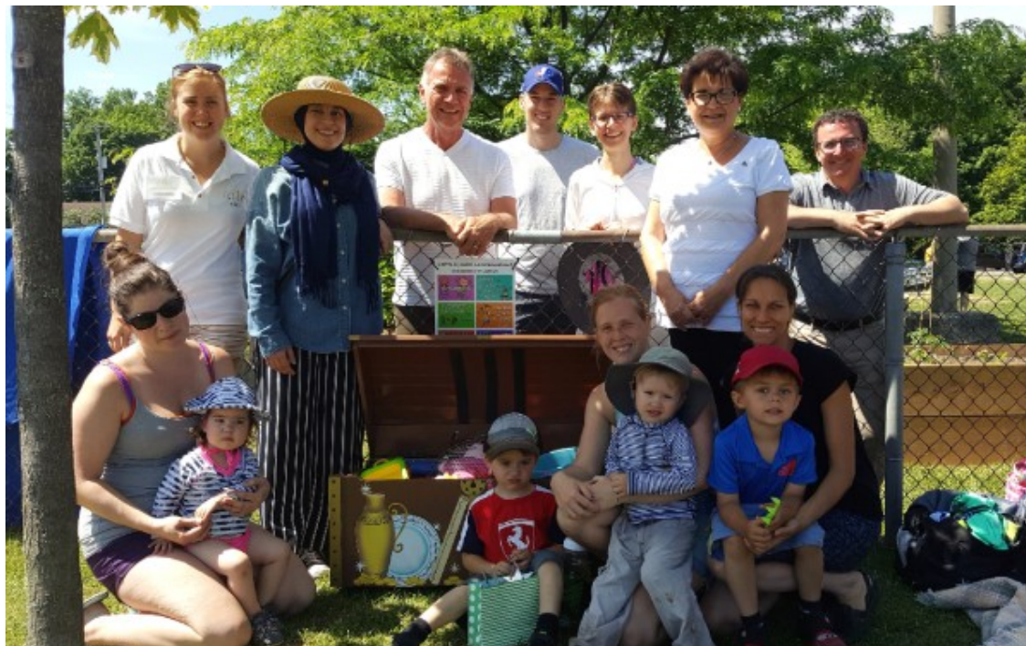
4 Korner was present at Deux-Montagnes' Park Day . The weather was great and all had a great time!