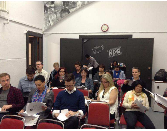
We hosted some AGMs and public meetings