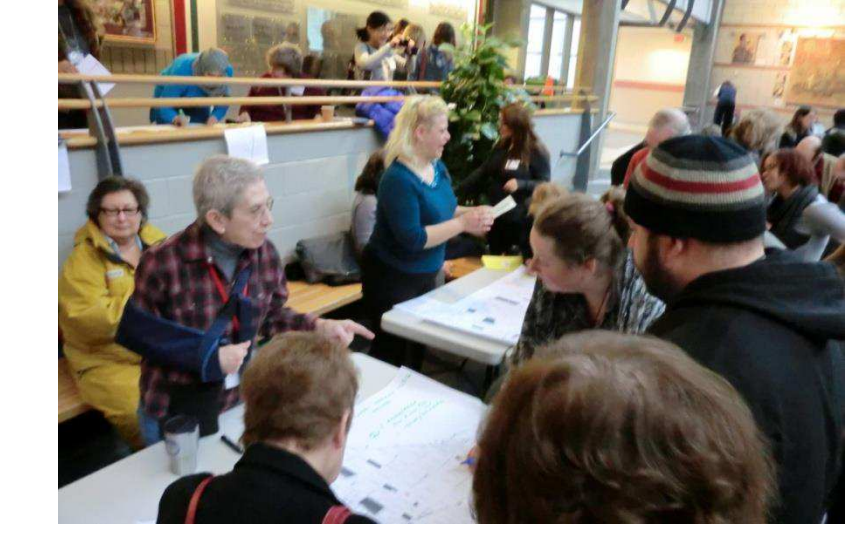
Need for a strong Table de Quartier