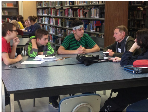
High School students interviewing seniors

Funding from Canadian Heritage provided VEQ with the opportunity to publish a unique book called Once Upon a Memory: Seniors and Youth Honouring Quebec City's English-speaking Cultural Heritage. This project included three generations of community members.