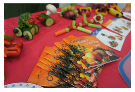
Wixx Move-a-thon 2015