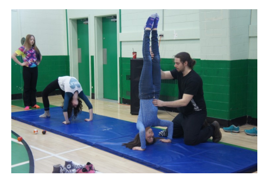
Performing Arts Festival 2015

The community was invited to the evening showcase of performances and a Battle of the Bands with student artists from across the Central Québec School Board in the Salle Jean-Paul Tardif auditorium. There were over 400 participants in the day's activities and 500 in the evening. VEQ hopes to continue its partnership with the CQSB by contributing to their future Performing Arts Festivals for both the high school and elementary levels.