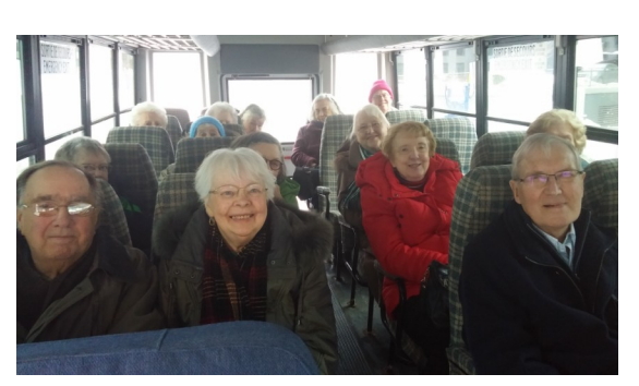
Bus to the Shannon Irish Show 2015

VEQ once again offered free transportation to the Shannon Irish Show on March 14, 2015. Almost 20 people rode the bus out to Shannon and enjoyed a great show celebrating Irish heritage in Québec.