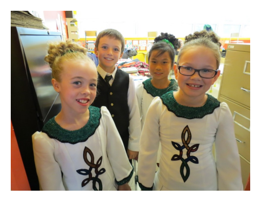
Fall Fest 2014

VEQ was fortunate to have overwhelming interest from community members wishing to join its board of directors. Board candidates made short presentations, then votes were cast and tallied. As a result, VEQ welcomed 4 new board members and 2 current board members were re-elected for a second term.