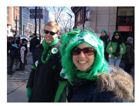
St.Patrick's Day Parade 2015

March 2015 brought the sixth edition of the Québec St. Patrick's Day Parade. VEQ was thrilled to participate again, bringing a fun group of staff and friends together to celebrate on a beautiful day. The festive green and white VEQ balloons added to the fun, while VEQ staff handed out shamrock stickers to promote the new website to the crowd.