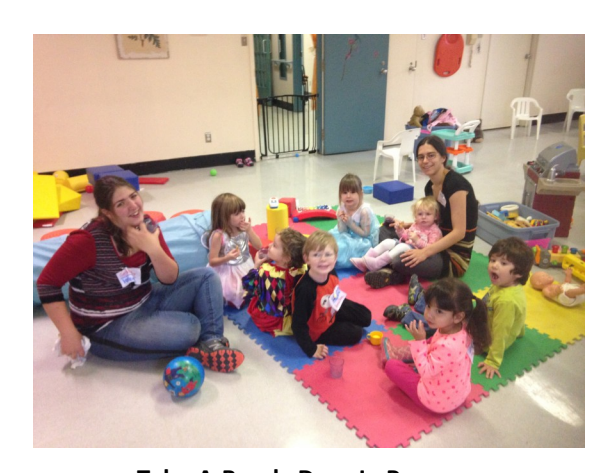
Take-A-Break Drop In Program