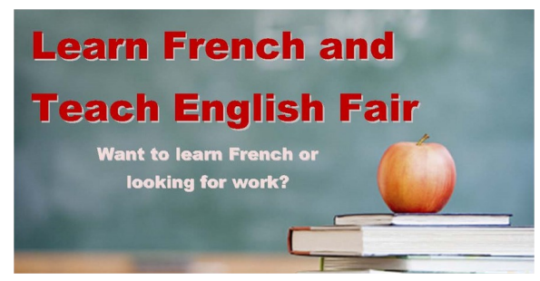
Learn French and Teach English Fair November 2014