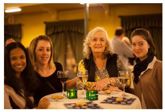
Holiday Happy Hour 2014

VEQ's Holiday Happy Hour was held on December 3, 2014 at the Morrin Centre in