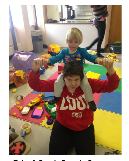
Take-A-Break Drop In Program

VEQ coordinated the volunteer Income Tax program for low-income Englishindividuals speaking and families. Volunteers who enjoyed working with numbers and taxes received training and access to tax software free of charge and then worked hard to complete tax files for the 2014 tax year. The coordinator worked with the client and social worker, ensuring that the volunteers had all the appropriate information so that the clients received the government benefits to which they were entitled. This year 35 tax files were completed. Volunteers gave over 50 hours of their time to complete the many files.