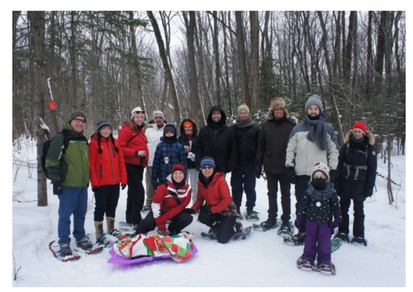
Snowshoe Excursion February 2015