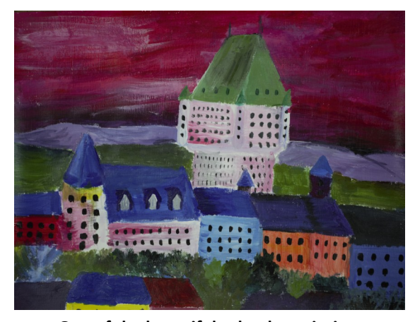
One of the beautiful calendar paintings

In partnership with Quebec High School, youth from secondary 1 through 5 were invited to submit a painting and description of a place or activity that specifically highlighted the contribution of our linguistic community to the development and history of our region.