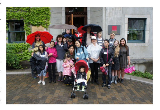
Newcomers Walking Tour of Old Québec June 2014

VEQ distributed more than 100 newcomer's packages with the help of supportive community partners such as Jeffery Hale Community Services, Valcartier Family Centre, Jeune et en santé, and the various schools and churches in our community.