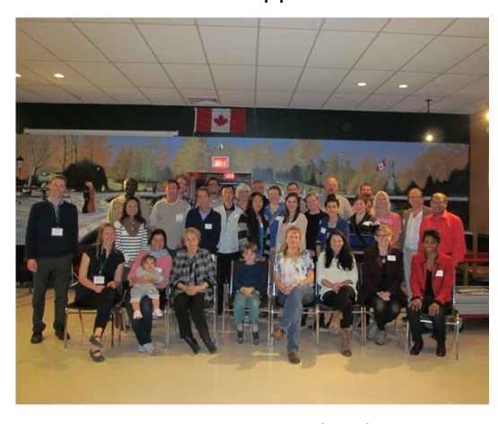
Meet & Greet: Taste of Québec October 2014