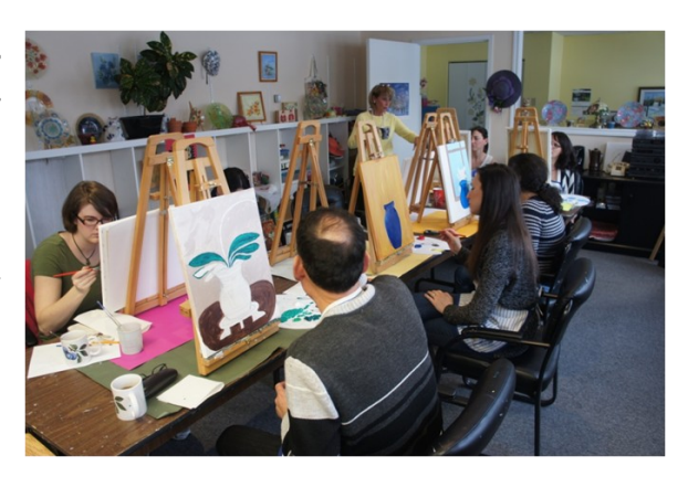
Newcomers Creative Corner February-March 2015