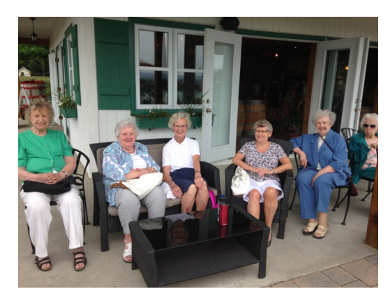
Seniors Out and About

Service Canada's New Horizons for Seniors program provided funding to VEQ produce video promoting to volunteerism by seniors and for seniors in our community. The video showed scenes of only a few of the many volunteer opportunities in the community such as: providing transportation for seniors to get to their appointments, friendly visits, technology workshops and the Community Christmas Hamper