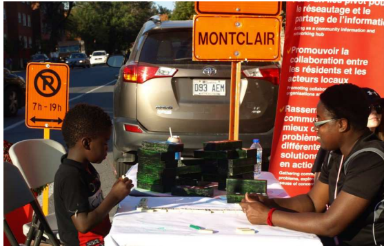
Parking Day 2017—Fielding-Walkley

Park(ing) Day is an international event designed to celebrate everyday choices for sustainable mobility and to advocate for favorable urban amenities by taking over a parking spot. Saint-Raymond, Benny and Walkley held their own eclectic version of parking day from coffee shops to hot dog stands to art and craft stations to a game of dominos! All gatherings were reflective of what residents wanted to see more of in the neighborhood. All three parking spots received a total of 150 residents in the area.