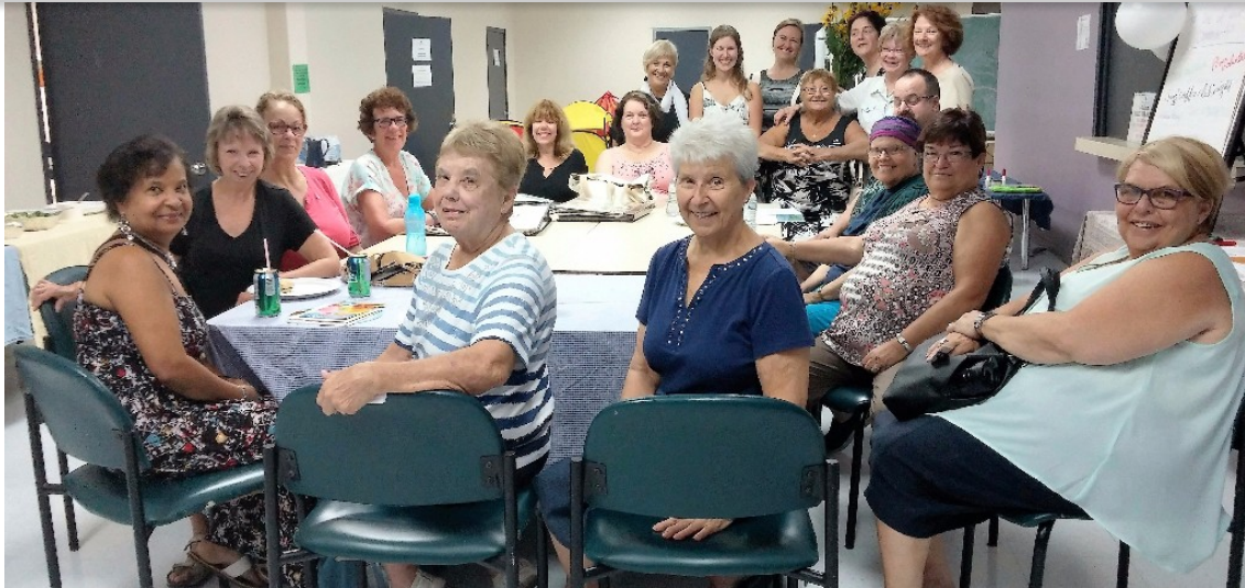
Another successful Open House at 4 Korner's!