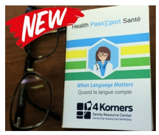
AVAILABLE NOW THE FIRST PRINT EDITION OF THE HEALTH PASSPORT ADAPTED TO THE LAURENTIANS AT ANY ONE OF OUR THREE CENTERS.