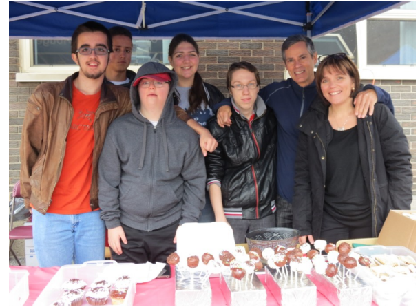
The SNACS Bar team providing treats for the crowd at Fall Fest

Fall Fest 2014 was a huge success with over 650 people coming out to St. Vincent Elementary on Saturday, September 20. Activity in the gym was buzzing with over 50 community groups and businesses showing the community who they are and what they do. St. Vincent's corn roast and the SNACS Bar kept the crowd fed while kids enjoyed facepainting, the balloon artist and other great family activities. Thanks to our collaboration with Be Active Québec, family Zumba sessions were held and a huge climbing wall was available for everyone to enjoy. Performances this year from the Shannon Irish Dancers, a Brazilian group called Pé Na Rua and the Blair Family Musicians rounded out the day, along with a fun Flash Mob performance by dancers from Quebec High School. As always, thanks to everyone who came out to celebrate the English-speaking community! See you again next year!