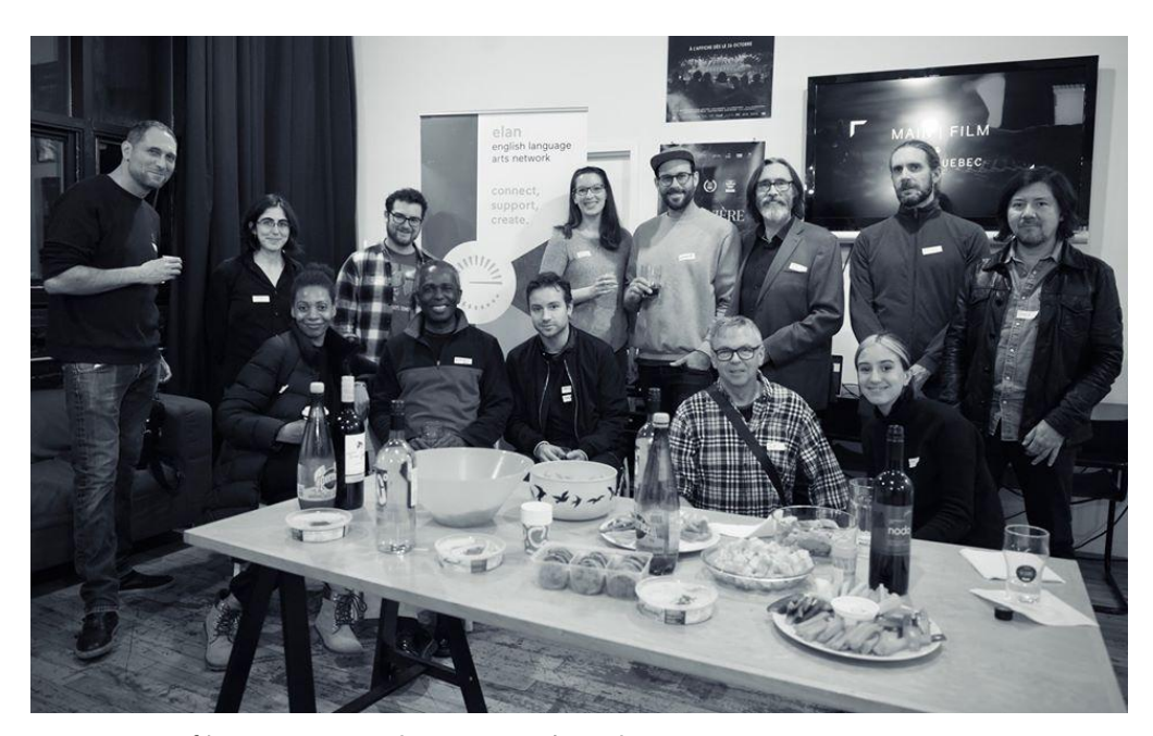
ELAN / Mainfilm event . October, 2019.

Though the final weeks of this period were spent organizing activities that the pandemic ultimately cancelled, we were able to re-launch many of them online, experimenting with and documenting virtual event options alongside our community. We now have the tools in place to continue supporting our 400+ members remotely, each of whom have been contacted directly for input as we plan our long-term response to Covid-19.