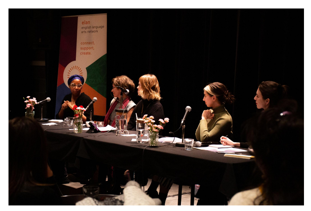
Creative Resilience Panel Event, January 2020.