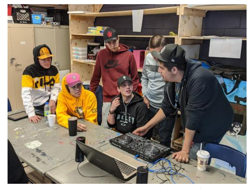
Students at Jimmy Sandy School learning the technical side of music making with Violent Ground.