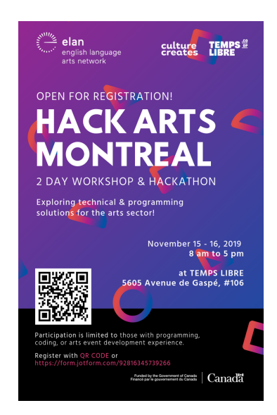
Hack Arts promo digital poster