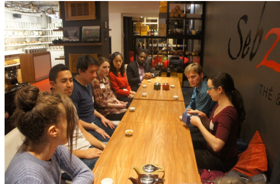
Diversity of Voices: Tea tasting January 2016

activities began with the first one being a corn boil on August 22 nd .