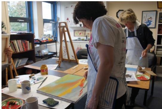
Newcomers Creative Corner