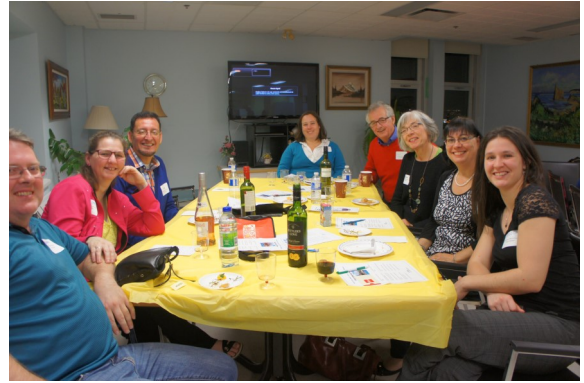
Newcomers Meet & Greet October 2015