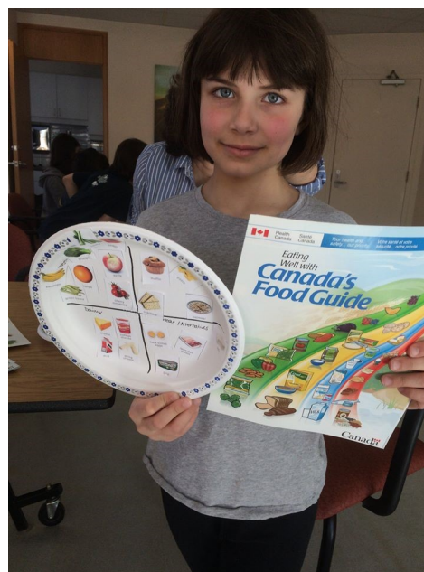
2016 March break activity