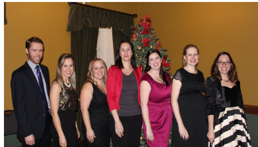
VEQ staff at Holiday Happy Hour 2015

delicious hors d'oeuvres and refreshments. VEQ would like to give a warm thank you to the Morrin Centre for sharing their beautiful space with us and to the local businesses who graciously donated to door prizes. We could not have asked for a better way to ring in the holidays.