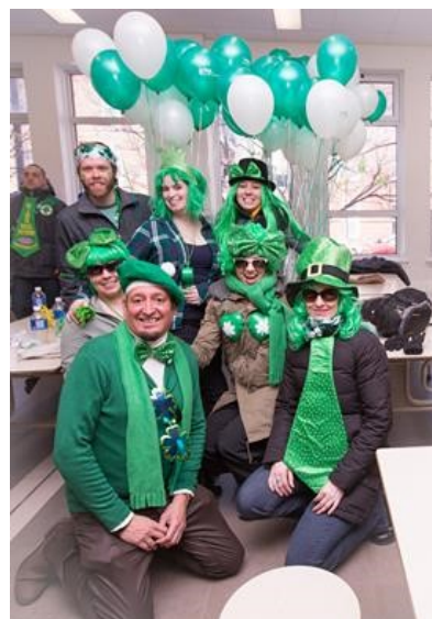
St. Patrick's Day Parade 2016

Once again this year, VEQ participated in the seventh edition of the Québec St. Patrick's Day Parade. VEQ staff and board members got all decked out in green for the occasion and walked the nearly 5 kilometer route while handing out shamrock stickers to children.