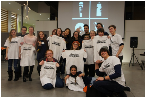
Join Forces for the Future January 2016

Thanks to funding from the Department of Canadian Heritage, VEQ undertook a new project this year which set out to inspire youth and help them find a future for themselves in their region as young members of the English-speaking community. Our goal was to allow youth to discover/re-discover their community's rich heritage and expose them to services and opportunities in our regions with regards to education and employment.