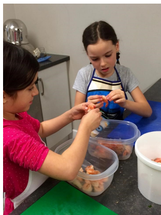
The Community Cooking class 2016

These individual cooking classes were open to the public and provided a hands-on opportunity to learn about healthy recipes, apply new food skills and foster a social and fun atmosphere for cooking. Registration was moved to an online platform on the VEQ site to facilitate management. Half of the ten classes offered were friendly to young families (child 5 years old and up, accompanied by adult). All recipes were reviewed by a professional nutritionist and will be compiled to produce a small booklet to share.