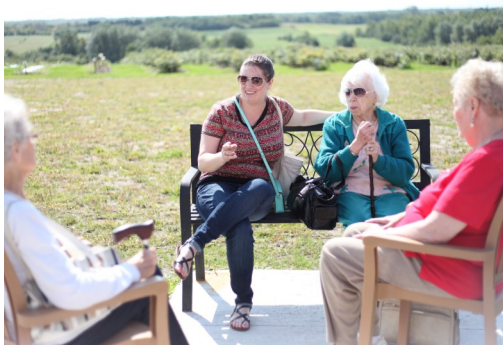
Seniors Out and About

This project provides English-speaking seniors with free transportation to community activities and outings. The objective of this program is to reduce isolation of seniors in our community while helping them to continue to live autonomously. A small bus is used to transport the seniors while a VEQ staff greets them at their door and accompanies them to the bus. In 2015 there were 20 outings to various community events and activities such as blueberry picking and visits to local spots such as Île d'Orléans, Marché du Vieux Port and Montmorency Falls.