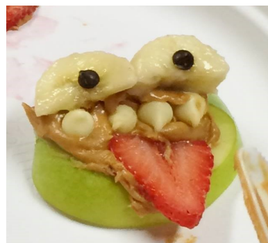
Travellin' Toddler Time October 2015

December brought a Christmas party that allowed families to enjoy healthy snacks and meet Santa Claus.