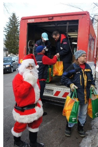
Community Christmas Hamper Campaign 2015