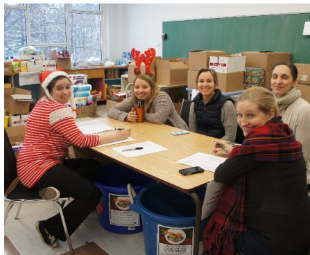
Community Christmas Hamper Campaign 2015