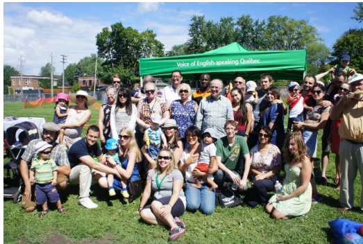
Newcomers Corn Boil August 2015