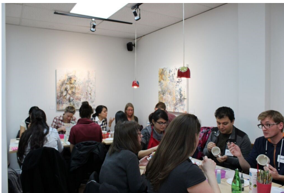
Diversity of Voices: Ceramics January 2016

Thanks to funding from the Department of Canadian Heritage, VEQ was able to undertake a brand new project this year which set out to build stronger links between the English and French speaking communities in the Quebec City region. This was achieved by hosting bimonthly bilingual activities throughout the year for the 20-35 year old demographic.