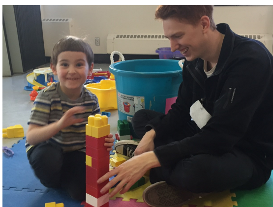
Take-A-Break Drop In Program

VEQ worked with our partners at the Jeffery Hale Community Services on their Take-a-Break Drop In program. This program offered a place for parents and their preschool children to get together two Friday mornings a month from 9:30 am to 11:30 am (November to May). Volunteers entertained children 18 months and older to give parents a break from child care, and gave them a chance to socialize and to listen to guest speakers. Babies under 18 months were welcome to stay with parents in the parent's space. This year, 10 sessions were held with 96 children and 75 parents attending. We are proud of our 32 volunteers who contributed a total of 120 volunteer hours.