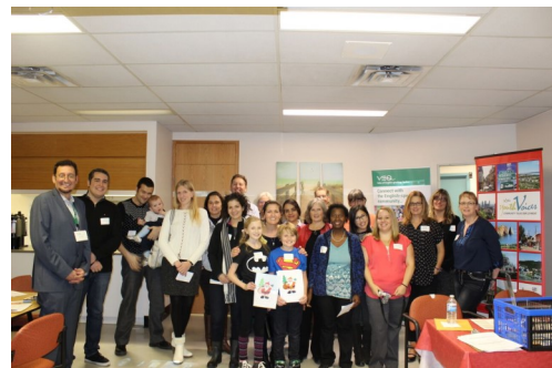
Newcomers Winds of Change November 2015