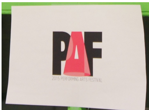
Performing Arts Festival 2015

dancing, singing, drumming and acting. In the afternoon there was an artists showcase with performances by some of the artists who were leading the workshops. After the artists showcase, students participated in an arts workshop of their choice. The workshops included belly dancing, hip hop, mural painting, circus, trapeze, cartooning, killer vocals, pottery, African drumming, magic, and photography.