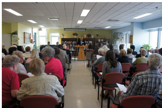
Annual General Meeting 2015

Over 60 people attended Voice of English-speaking Québec's 34th Annual General Meeting held on May 28, 2015 in the Coin Soleil room at Jeffery Hale Hospital. Members had the chance to hear about