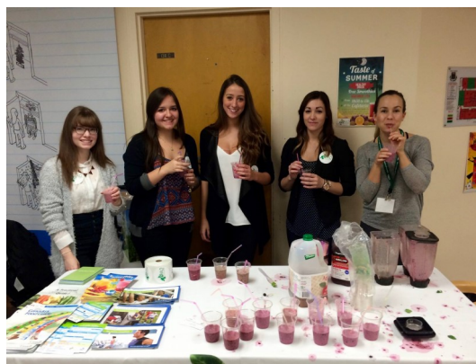
St. Lawrence September 2015

Be Active Québec's work continued with the Central Québec School Board, getting involved in as many schools as possible. One of those schools were St. Lawrence College which expressed interest in utilizing BAQ's special smoothie bike as part of one of their projects. As a result over 165 smoothies were served!