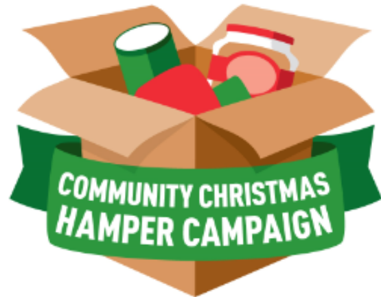
Community Christmas Hamper Campaign 2015

In total 197 volunteers sorted, counted, packed and loaded hampers for delivery to 217 families in need. The organizing committee was happy to announce that they met the $25,000 fundraising goal through personal donations ( www.qchampers.ca ), fundraising events, and the overall generosity of all those involved.