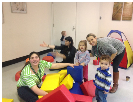
Take-A-Break Drop In Program

VEQ coordinated the volunteer Income Tax program for low-income English-speaking individuals and families. Volunteers who enjoyed working with numbers and taxes received training and access to tax software free of charge and then worked hard to complete tax files for the 2015 tax year. The coordinator worked with the client and social worker, ensuring that the volunteers had all the appropriate information and the clients received the government benefits to which they were entitled. This year 28 tax files were completed. Volunteers gave approximately 50 hours of their time to complete the files.