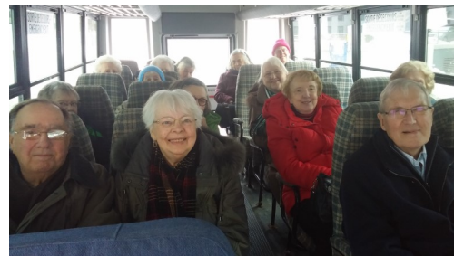
Bus to the Shannon Irish show

VEQ once again offered free transportation to the Shannon Irish Show on March 12, 2015. Over 20 people rode the bus out to Shannon and enjoyed a great show celebrating Irish heritage in Québec. This year marked the 50th edition of the show.