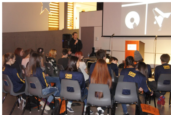
Join Forces for the Future March 2016

In March, VEQ hosted a second installment of the forum which focused on leadership and healthy living for 102 students at Quebec High School. Students were able to learn first hand from a past Olympian about his personal journey and find new resources in our region with regards to employment and healthy living. In total, over 120 youth participated in both forums.