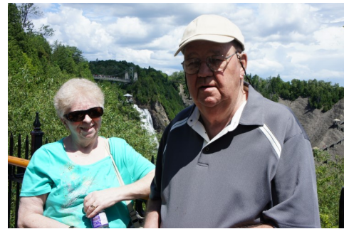
Seniors Out and About