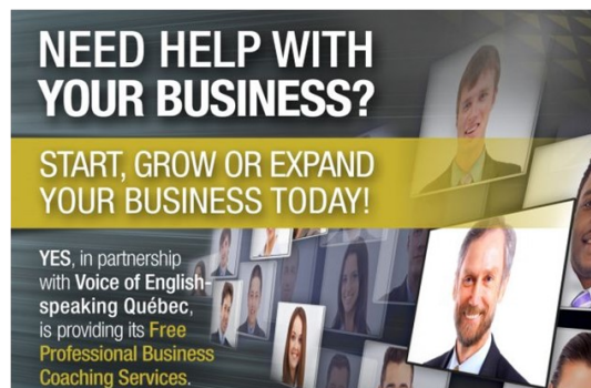
Youth Employment Services 2015

Thanks to a strong partnership with the FORT Program, VEQ continues to refer many clients to their program which offers employment counseling services to English-speaking residents.