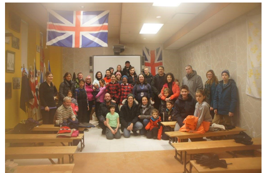
Snowshoe Excursion January 2016

when many people are inclined to curl up indoors, to try one of Québec's popular winter activities, snowshoeing, while meeting and mingling with other newcomers. It was a great success and we hope to do it again in the future. This year the event was held at the Plains of Abraham with tour guides who provided us with the history of snowshoeing in Québec and concluded with a nice hot cocoa. Thanks to everyone that came out to make the day so wonderful!