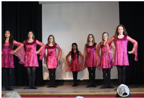
Fall Fest 2015

Thanks to partnerships with Citizenship and Immigration Canada, Jeffery Hale Community Partners, Department of Canadian Heritage and the Ville de Québec, over 650 community members joined VEQ at St. Vincent Elementary on September 19, 2015 for the sixth annual Fall Fest.