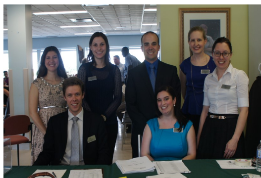
Annual General Meeting 2015