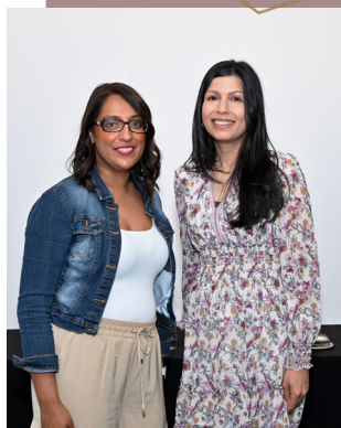
St. Charles Elementary