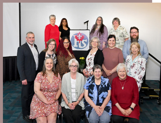
Special guests join QFHSA board and staff members