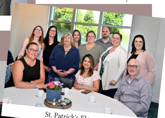
St. Patrick's Elementary