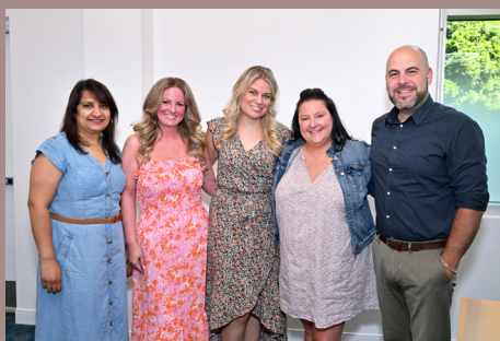
Terry Fox Elementary (Laval)