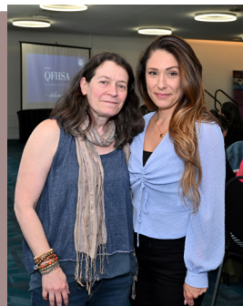
Children's World Academy