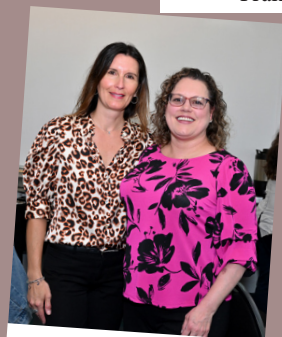
Macdonald High School