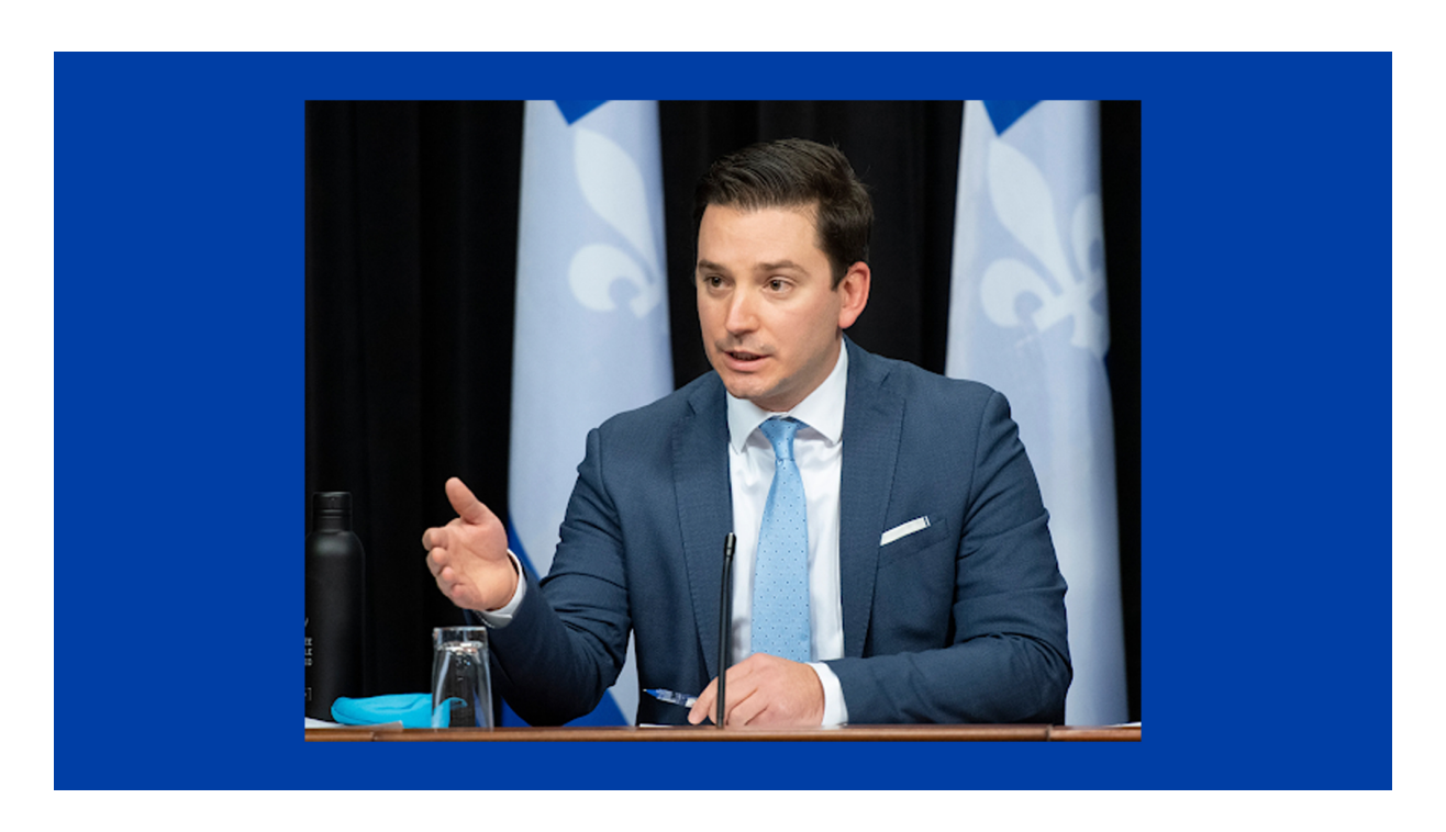
Legislation - on sex and gender?

From Montréal to the Gaspé, municipal elections are taking place on November 7<sup>th</sup>. Click here to learn more about the process, voting eligibility and what issues are addressed at the municipal level.