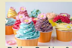
Baking, Cooking & Catering