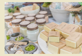
Other Products & Services