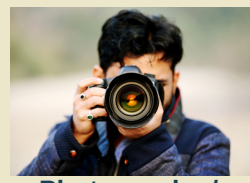
Photography / Creative Services