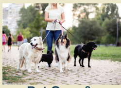
Pet Care & Child Care