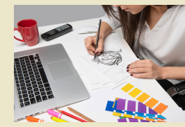
IT & Graphic Design