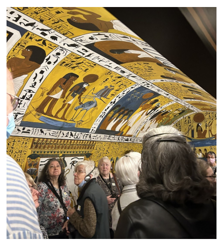
Trip to the Museum of Civilization with Lifelong Learning.