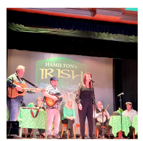
The show that was enjoyed by all on March 11 in Shannon.

Spring is just around the corner, and Out & About is revving up in the months of March and April!