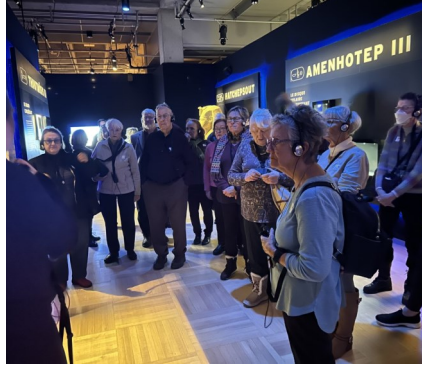
Learning about the Age of Pharaohs at the Museum of Civilization.