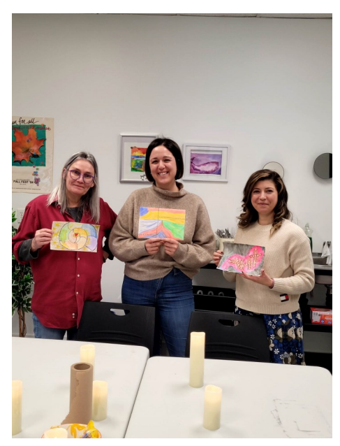
Art Workshop in Shannon.

The VEQ Community Space continues to bubble with activities including In Stitches, the knitting and crocheting club, our Community and Coffee on every first Monday of the month, and the popular Chair Yoga—which has recently expanded to the neighboring municipality of Saint-Gabriel-de-Valcartier.