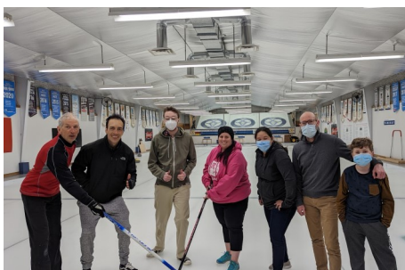
A few memories from our morning spent curling.

April 23rd— NEW! 12 newcomers from Australia, Canada (Newfoundland, Ontario), China, Dubai, Finland, France, India, Mexico, and Romania tried curling for the very first time in their lives! It was surprisingly tiring and, as you can imagine, a lot of fun! Definitely an activity worth repeating next winter.