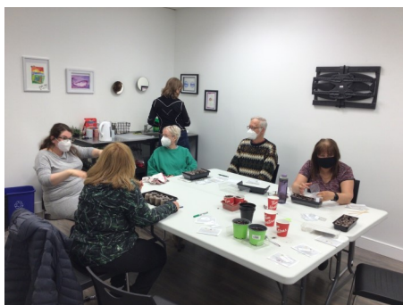
Planting seedlings and socialising in our Community Space.

Our Community Space is open on the first Monday of every month between 10 a.m. and noon. Stop by for coffee, a chat or some baked goods! The next drop-in date is Monday, June 6th. The address is 438 Boul. Jacques Cartier, Shannon.