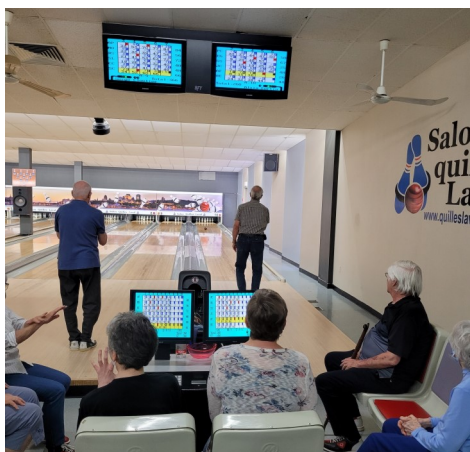
May 28th—Bowling Outing, followed by lunch.