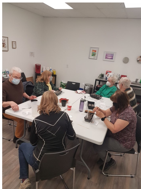
Making good use of our Community Space for Earth Day on April 22nd.