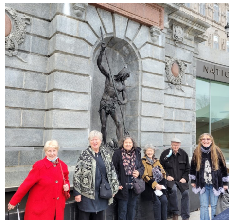
Some of the participants of our guided Parliament visit in April.