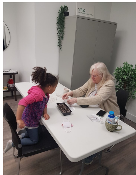
We had a very special little visitor too!