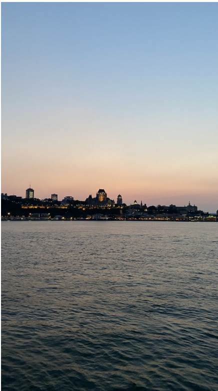
From the archives—Sunset Ferry Ride 2021

We are gearing up for a season of activities under the sun!