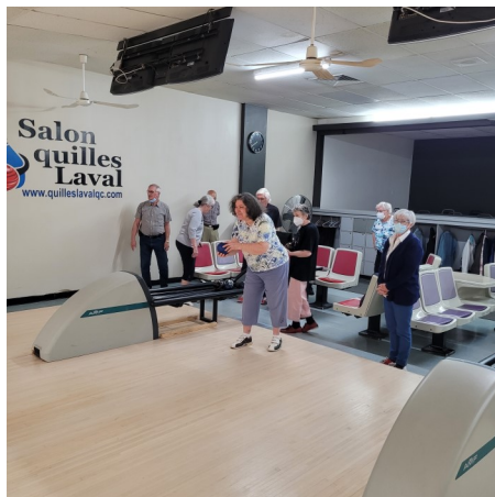
Bowling Outing—Going for a strike?!