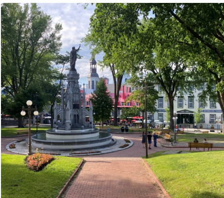
Learn more about beautiful Québec on our guided tour!

This popular activity sold out very fast, and we are in the process of releasing more dates for more tours. Stay tuned!