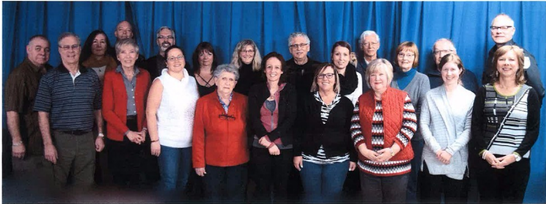
Photo taken at a press conference in Lachute on June 16, 2017