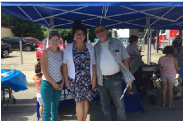
4 Korner's at Deux-Montagnes en fête!