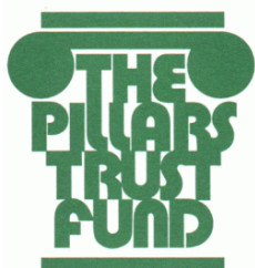
Pillars Trust Fund