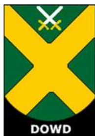
Father Dowd Foundation