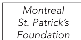
Montreal St. Patrick's Foundation