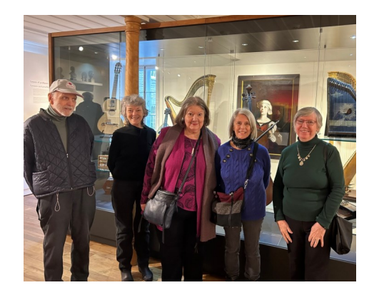
Happy visitors of the Ursulines Monastery

November December and have been busv for Out & About 50+ participants, but winter hibernation is fast approaching, and we will take short break from outings for the holidays and early January.