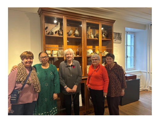
A lovely outing to the Ursulines Monastery in November