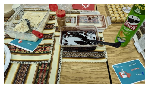
Food from Québec, Peru and Morocco at the Potluck for newcomers

India, Canada, Costa Rica, UK and USA. 26 participants brought specialities from their hometown and had an amazing time sharing meals with other newcomers.