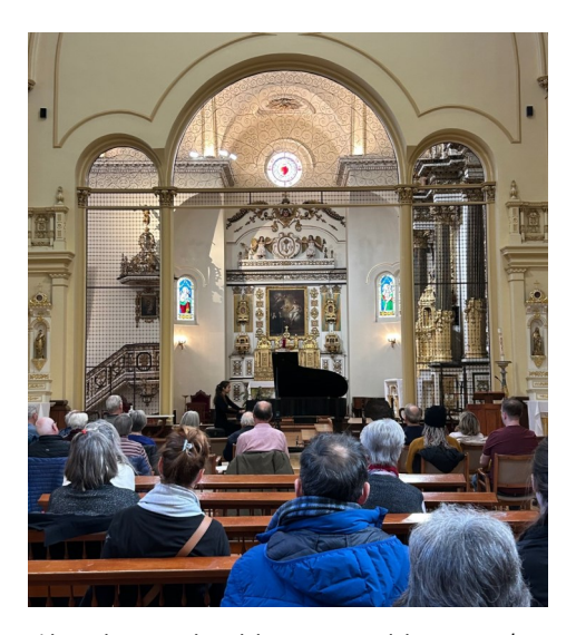
Listening an inspiring compositions at the Chapelle des Ursulines