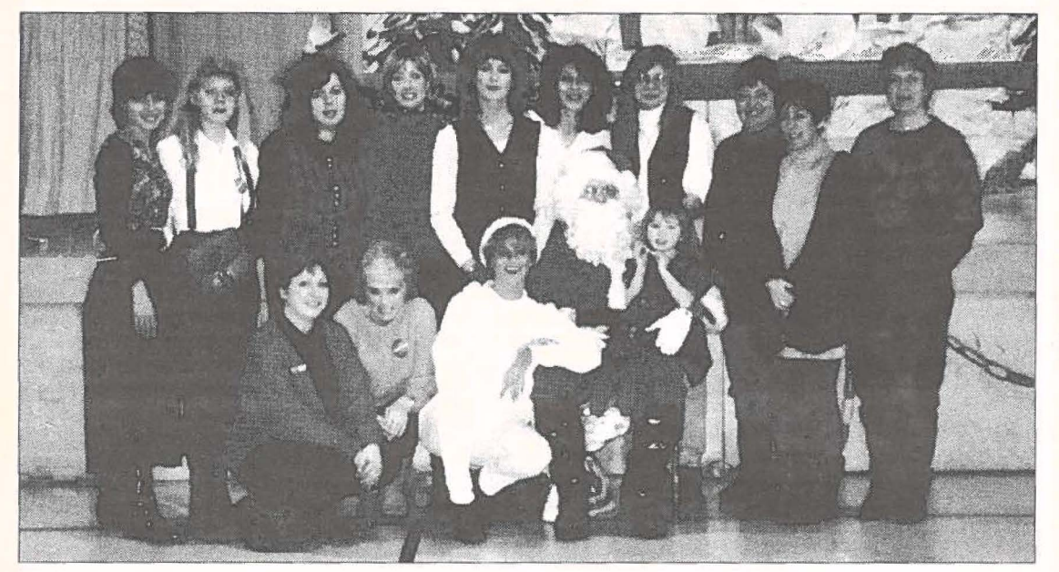
Santa and some of the Souvenir volunteers in the school gym.