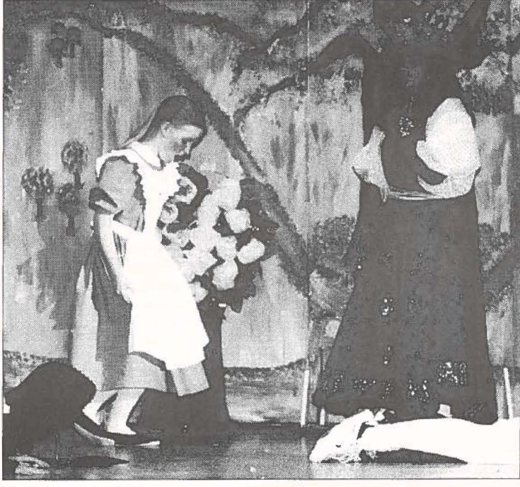
Alice in Wonderland a smash hit!