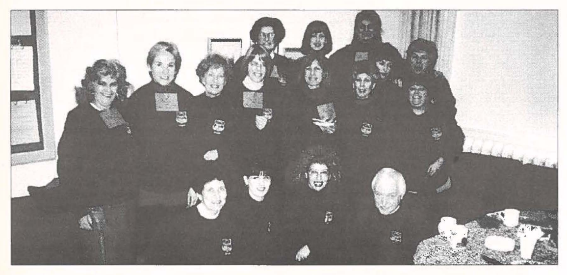
EB Staff wearing "Staff" sweats — a gift from the Home & School Association during Teacher/Staff Appreciation Week.

What do these educational values mean to parents? First of all parents play a vital role in the educational system today. They are a part of the process, not merely observers. It is also important for parents and their children to appreciate the value of education and the importance of what is being learned, not just the marks on the report card. Finally we need to reinforce educational values at home along with the other basic values we are teaching our children. We have to supply our children with enough "small change" along with the "large bills" to make the right choices in life and be able to meet their own needs