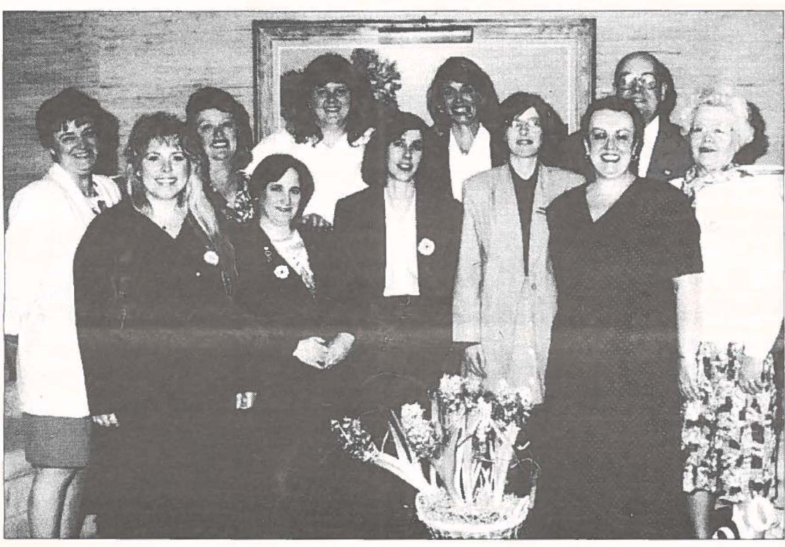
Our proud 'new' Executive. See box at right.

"Nevertheless, I believe we still have the best education system in the world," claimed the amiable educator towards the end of her address to the 52nd AGM of the QFHSA.