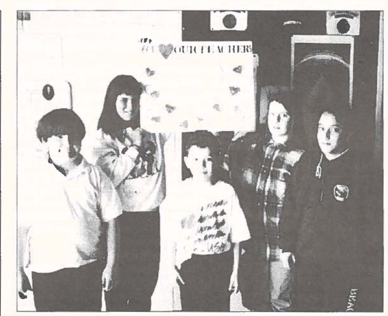
Some Kids for Peace club members hold up poster they made showing their love for their teachers for Teacher Appreciation Week at Beacon Hill School.