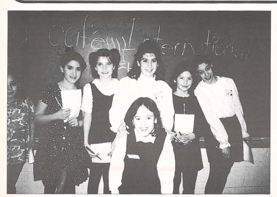
During nutrition month, these young ladies helped out by serving some of the many delicious foods parents had prepared.