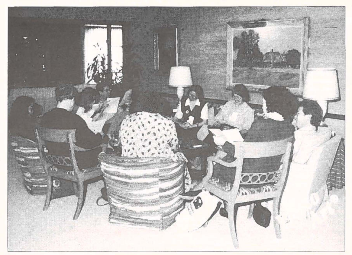
Yes, we work too, at the AGM. Intense deliberations over wording of some resolutions.