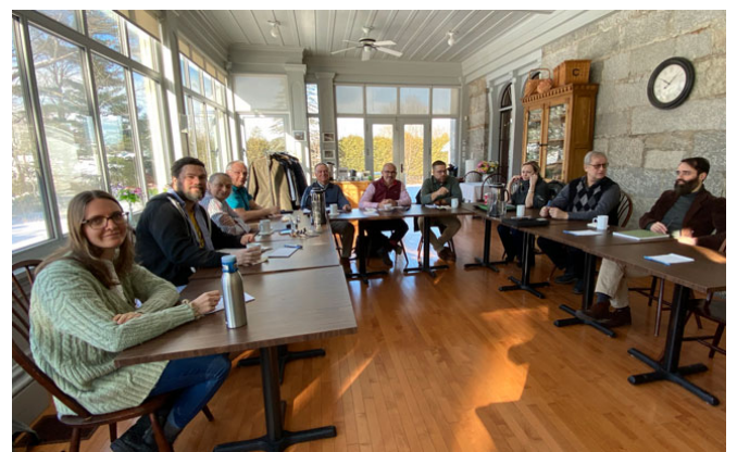
Stanstead stakeholders gathered at the Musée Colby-Curtis Museum, on February 21, 2023, for a Collaborative Economic Development Innovation Conversation to explore how to increase tourist traffic and spend in Stanstead this season.

Stanstead stakeholders gathered on February 7 and 21, 2023, at the Musée Colby-Curtis Museum to pursue their exploration of how to increase tourist traffic and tourist spend in their community during the upcoming tourist season. Following an assessment of local assets and talent in the areas of hospitality, culture, and sports, stakeholders focused on developing and promoting Supper & Event packages