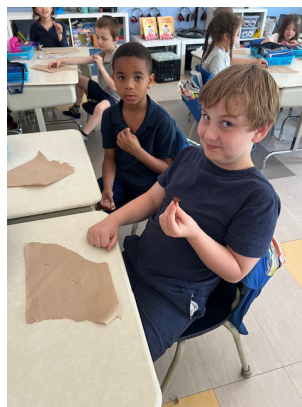
Maple Grove students learning all about fungi

When students got back to in-person classes in 2021/22, the QFHSA was ready with Youth Exploring Science grants to help foster a love of science at both the elementary and high-school levels. The QFHSA has been amazed by the creative science projects proposed and executed by our schools. Hydroponic gardens, vermi-composting, different energy sources, mini labs—there has been no shortage of things to learn with the help of a QFHSA Youth Exploring Science (YES) grant.