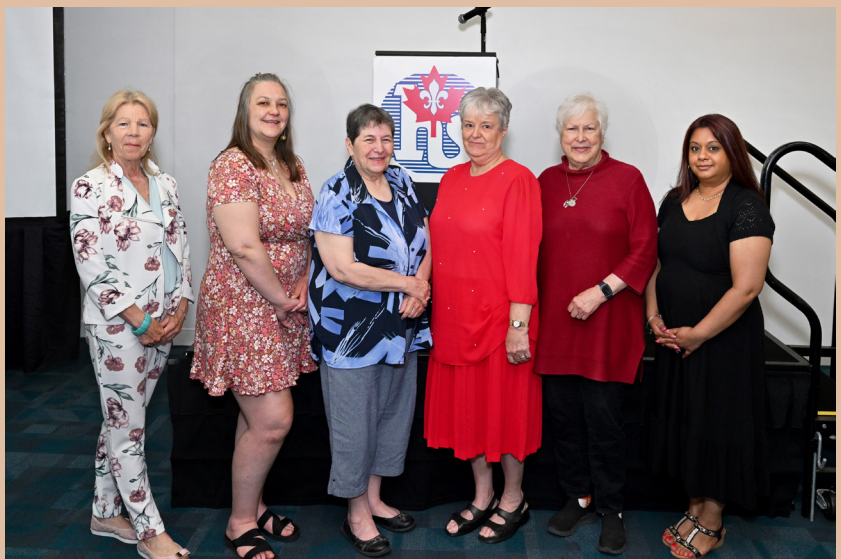
Members of the QFHSA Board of Directors at the 2024 Awards Luncheon

When you help a non-profit organization accomplish its mission, you are providing a huge service to your community. Please call the QFHSA office at 514-481-5619 or email info@qfhsa.org and we'll be happy to tell you more!