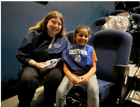
At the Movies