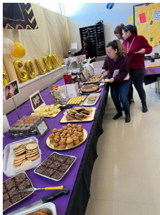
Teacher and Staff Appreciation Week

Although not a large Home and School, the Crestview team manages to create a massive amount of fun. Here is just a partial list of the amazing things Crestview's six very active Home and School volunteers were up to in 2023/24: They gave every student and staff member a specially-designed T-shirt at the start of the school year; provided pumpkins for decorating at Halloween; invited Santa and Mrs. Claus to visit with a photographer in tow; brought in Valentine's Day cupcakes for all; organized an Easter Egg Hunt; assisted with a school-wide excursion to the movies; and orchestrated a Willy Wonka themed Teacher/Staff Appreciation Week. It was a busy year!