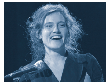
Heather O'Neill takes home QWF's 2007 Paragraphe Hugh MacLennan Prize for Fiction for Lullabies for Little Criminals.

1270 Chemin Ste-Foy, Suite 2000 Québec, QC G1S 2M4 Tel : (418) 684-2289 Fax : (418) 684-2290 E-mail : jjohnson@chssn.org Website : www.chssn.org