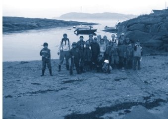
The Eau-Naturelle Discovery Camp, in partnership with the Coasters' Association, realized a very successful Kids Summer Camp in Chevery during the summer of 2007.