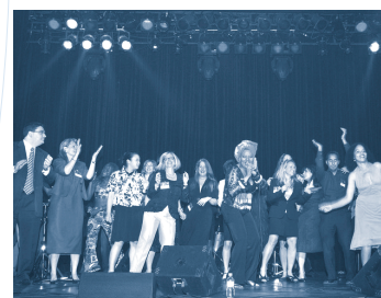
An impromptu finale, which united the three musical guests and the entire YES Montreal staff on stage for a quick rendition of "Proud Mary", brought the evening to a memorable close.