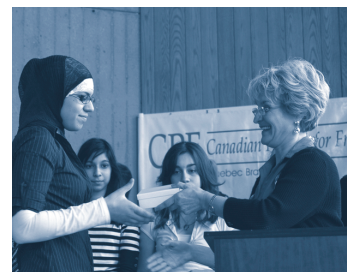
Canadian Parents for French – the provincial French language public speaking contest held at Concordia University May 10 th saw 50 high school students competing for the chance to win $20000 scholarships to the University of Ottawa.