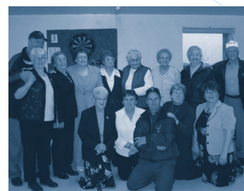
The Senior Citizens Committee of St. Paul's River organized a special "Mother's Day" event in May, 2007, for the elderly.

460 Ste-Catherine W., Suite 807 (Metro Place des Arts) Montréal, QC H3B 1A7 Tel: (514) 875-8698 Fax: (514) 875-8873 (call first) E-mail: qdf@quebecdrama.org E-mail : qdfadmin@quebecdrama.org Website : www.quebecdrama.org