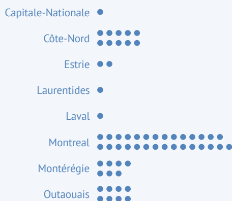
Figure 2: Number of Public Institutions and Facilities Designated to Offer Services in English, By Region

Note: This does not include institutions with Access programs. Source: Quebec, “Services for the English-speaking population,” Gouvernement du Québec, accessed Oct. 2, 2023. https://www.quebec.ca/en/health/health-system-and-services/rights-recourses-and-complaints/services-english-speaking-population .