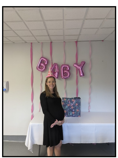
And congratulations again on your beautiful baby girl!