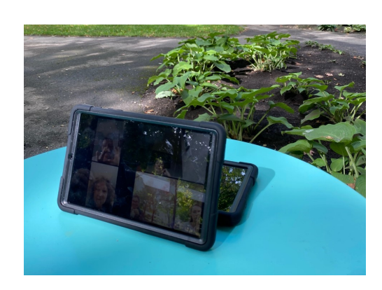
Lovely weather and technology calls for a Tech Talk meeting in the park!

Our tablet-lending library and Tech Talks continued throughout the summer and fall. Participants travelled virtually to Kenya, Bilbao and London, learned more about how to access e-books, podcasts and borrow books virtually and shared their knowledge by leading talks on quilting and reflexology.