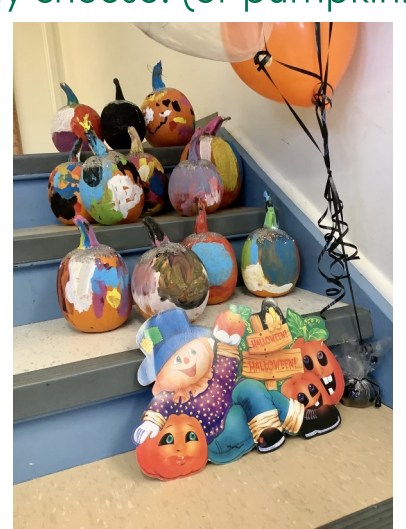
How cute are those decorated pumpkins from VES?!