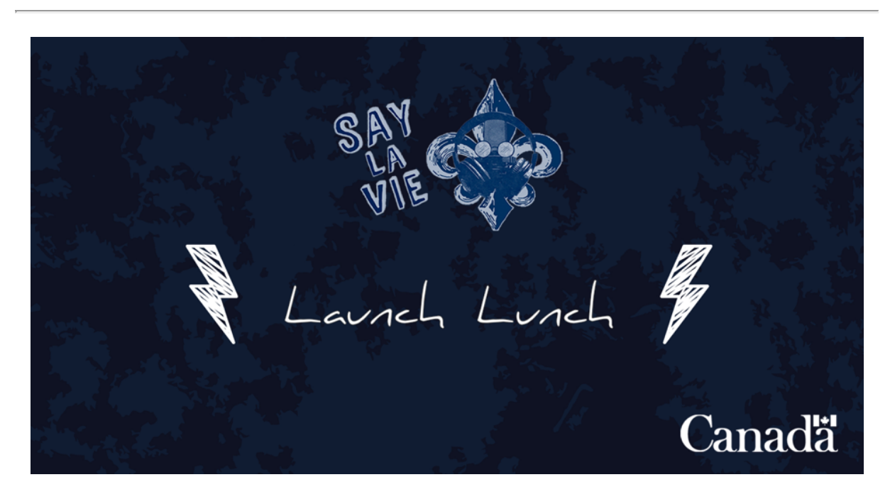
Online Launch Lunch