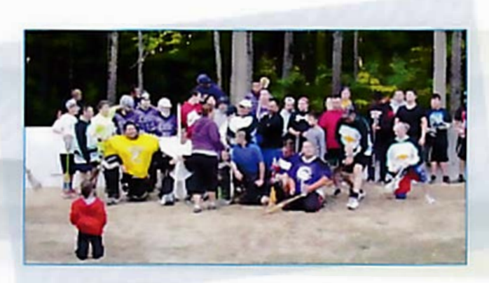
Lacrosse in Kanesatake, sponsored by Québec en Forme Deux-Montagnes