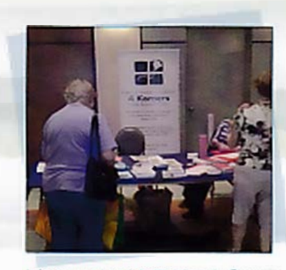
Information booth in Thérèse-de-Blainville