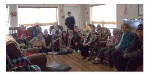
Youth and St. Paul's school provided an afternoon of beautiful music to the residents of Beaux Sejours (January 2016)

Home visits are offered to seniors who are unable to participate in the Day Center activities (especially during the winter months). It has proven to be a much needed service and seniors enjoy having the Animators visit them on a regular basis; however, they are always encouraged to participate in Day Center Activities.