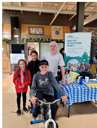
Smoothie Bike fun on June 18 for Dad Fest at Valcartier Military Family Resource Center.