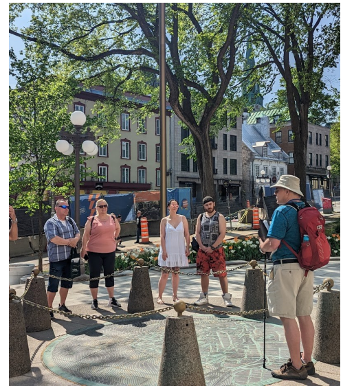
Old Québec Walking Tour for Newcomers