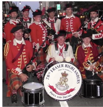
78 th Fraser Highlanders (July 19 juillet)