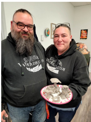
Art Workshop in Shannon.