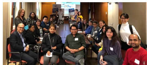
Attendees and speakers at CQSB Info Session #3

We'd also like to acknowledge the Valcartier Military Family Resource Center (FORT Program) who hosted a CV Clinic earlier that week in part to support candidates interested in CQSB positions. Thank you!