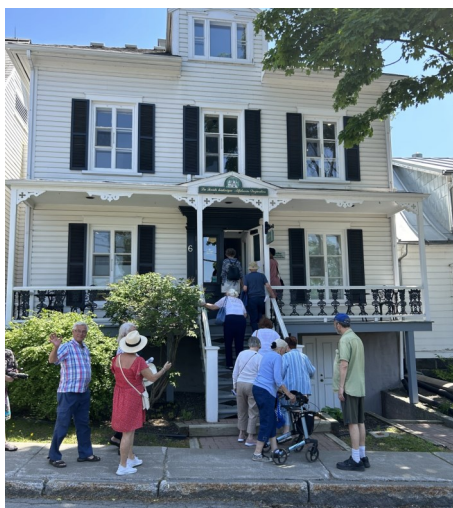
May 31—Day trip to Lévis with Lifelong Learning and the South Shore English Network