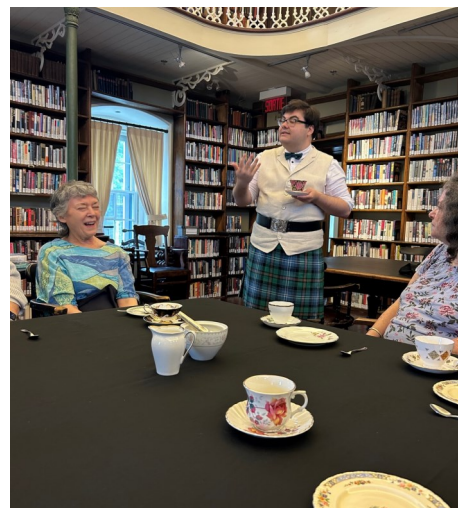
June 15—Teatime at the Morrin Centre