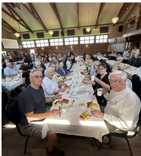
May 28—CWL Breakfast in Shannon