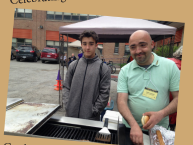
Cooking burgers at a school event