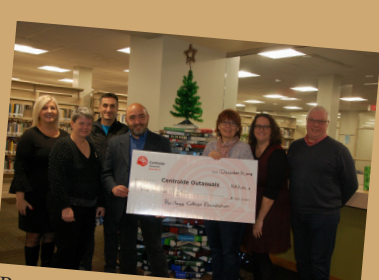
Recognizing the Heritage College Foundation/Centraide partnership to support students and families in need