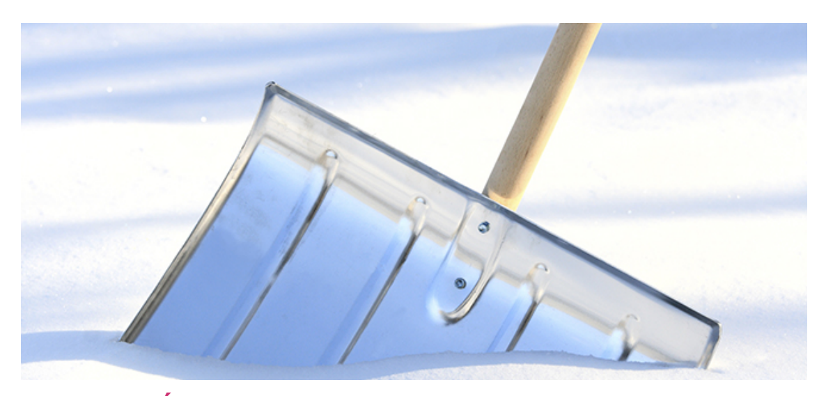
Éducaloi - Snow Clearing and the Law: What You Need to Know

Check out the rest of our newsletter for information programs and activities for parents, seniors and caregivers - as well as tips from Educaloi, a sneak peak at March 2017 and more!