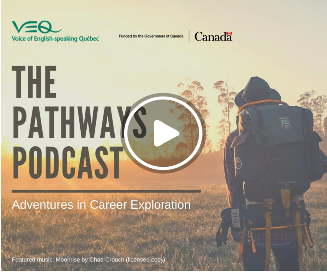
Click on the image above to be brought to the Pathways Podcast playlist on YouTube.