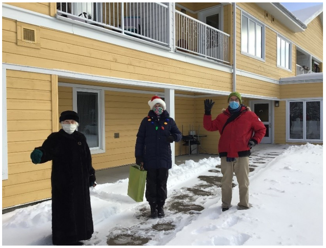
A safe outdoors Christmas carolling in December 2020.

To top it off, on December 15, all Valcartier Elementary School classes walked to a nearby residence for seniors, as well as the municipal building to perform these Christmas carols live—safely, outside and in -15°C weather! Residents of the Habitations de St. Gabriel-de-Valcartier, as well as Valcartier municipal staff, were thrilled and enjoyed this touching moment.