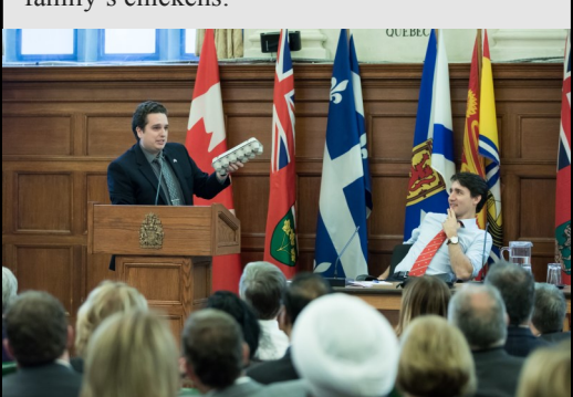
"Mr. Speaker, I want to thank the member for <u>Laurentides—Labelle</u> ... for his tireless work on rural issues.

Shortly after becoming your Member of Parliament, I got to work on rural issues. I founded the National Liberal Rural Caucus which today has over fifty paid-up Liberal Members of Parliament from all across rural Canada. We meet weekly to discuss rural issues so that we can unite our voices to be heard at the national level. I recently traveled to Sept-Îles and Baie-Comeau to continue bringing together rural ridings and to discuss the issues we share with local business and community leaders. Internet access and cellphone service are among the most significant issues across all of rural Canada. Our government is making substantial investments in upgrading those services. Last fall, I had an opportunity to discuss rural issues with the Prime Minister, at the end of which I offered him a dozen eggs from our family's chickens: