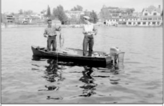
Lac des Sables, Sainte-Agathe-des-Monts in 1955

Today, the mills are gone and the ouananiche are forgotten. Many have tried to clean things up, but each generation takes a single step of that staircase, wanting the river to be put back to the way it was when they were younger. The top step is too far back for anyone to remember. Today, few dams serve an economic purpose and the forests are coming back in protected waterfront areas. We can look back up the staircase to the top and imagine the gigantic pine forests and rivers teeming with trout while we work together to decide what we want our children and grandchildren to inherit.