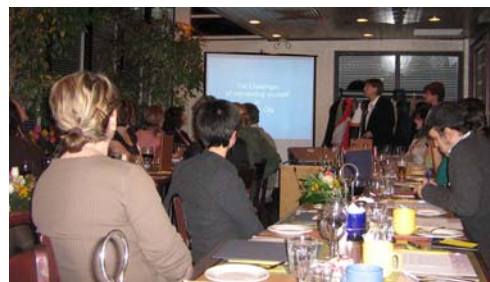
Winds of Change Workshop

Session evaluations indicated that these evenings provided attendees with new insights and strategies to help ease their adaptation process. Participants unanimously recommended the sessions to others and hoped they would continue in the fall. VEQ plans to offer another series starting this fall.