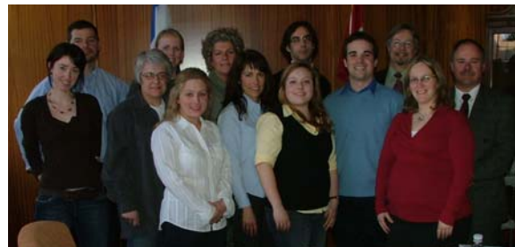
Youth Advisory Committee Members

Our Youth Advisory Committee strengthened partnerships with 16 French- and English-speaking stakeholders concerned with youth issues. The success of these meetings was due to the contribution of CEGEP Champlain - St. Lawrence and Université Laval students, representatives from Service Canada, CEGEP Champlain - St. Lawrence, Valcartier Family Centre, Forum Jeunesse de la région de Québec / CRÉ Capitale-Nationale, Université Laval, Emploi-Québec, Groupe Perspective, Jeffery Hale, Eastern Québec Learning Centre, Ville de Québec, Québec / Chaudière-Appalaches CeDeC, and Québec High School.