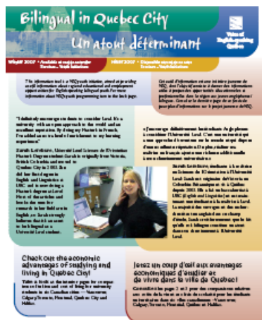
Info Tool Bilingual in Québec City.. un atout déterminant

VEQ participated in Québec : une région jeune , a local forum looking at strategies to counteract the youth out-migration in the Quebec City region. VEQ was also invited to participate in a Canadian Heritage Official Languages Support Programs Directorate brainstorming day called “Journée de réflexion sur la jeunesse” held on March 7, 2007 in Gatineau. We had the chance to present the successes and challenges facing our region’s English-speaking community’s youth and to increase our awareness of the reality of French-speaking minority communities outside the province. Representatives from three foundations representing all the provinces and territories except Québec and guests from