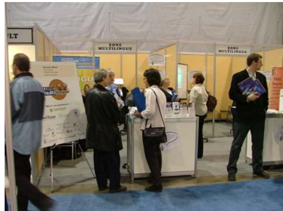
Multilingual Zone Quebec City Employment Fair

Group (CPG) to expand the visibility of our organization's employment services. VEQ was also an active part of the Multilingual Zone during the 2007 Quebec City Employment Fair partnering with Emploi-Québec, Québec Multilingual Committee, Québec Chamber of Commerce, Expotech, Eastern Québec Learning Centre, Valcartier Family Centre, Université Laval, Quebec Chronicle-Telegraph, CeDeC, and Séjours Linguistiques VTE to help jobseekers see bilingualism as an increasingly valuable asset on the Quebec City job market.