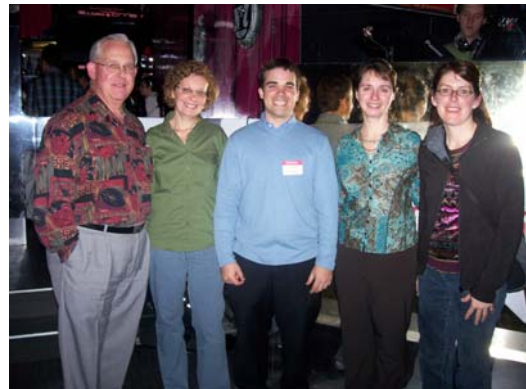
VEQ Staff Halloween Happy Hour

This committee met many times in preparation for this year’s annual general meeting which will also serve as a venue to celebrate VEQ’s 25 th anniversary. We hope that everyone who attends will appreciate the time and effort put into organizing this celebration.