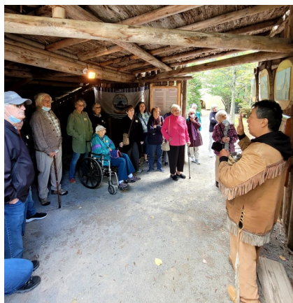
A visit to Wendake to learn about the Wendat culture.