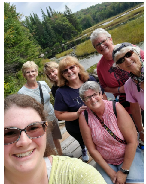
Walking Distance participants at Mont-Bélair in September 2022.

Nov 14—Enjoy the beautiful walking trail in Saint-Gabriel-de-Valcartier. Transportation will be provided from Shannon.