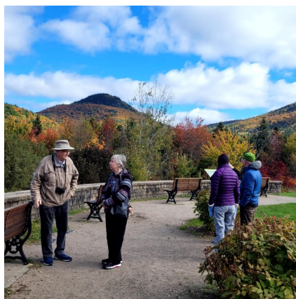
Enjoying the beautiful fall foliage of Stoneham.

Out & About had a fun and colourful fall! In September, participants went to the Cidrerie & Verger St-Nicholas , and enjoyed apple picking and picnicking by their charming outdoor farmers market. Searching for fresh and authentic apple products and cider vinegars? Look no further!