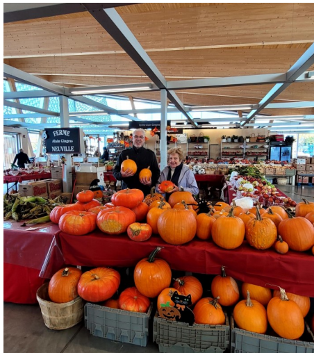
It is pumpkin time in the Northern Perimeter!

The satellite office has had a busy September with the Community Space bustling with its regular and new activities, such as chair yoga, knitting, information sessions, meetings, as well as Community and Coffee on the first Monday of every month.