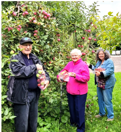
Apple picking in St-Nicholas.