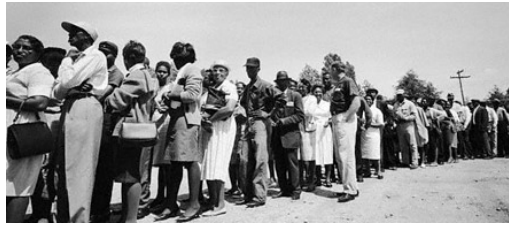
These folks didn't risk their lives voting for us to slack off.

Remember, many of us already work part-time, and paying taxes to the provincial and federal governments. And if the system does not meet your needs, we must speak up and be heard.