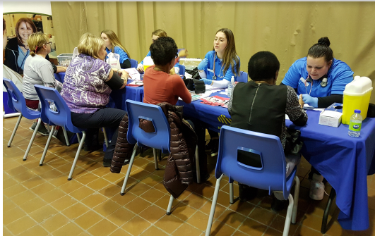
Community members and John Abbott College nursing students.