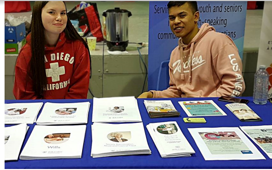
Volunteers from Lake of Two Mountains High School manning the 4K table.