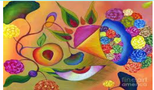
Breakthrough Conversation: by Rachelle Lamb

Words can be Windows or Words can be Walls