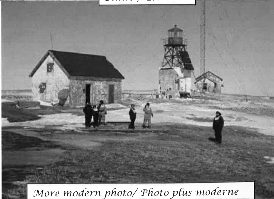
More modern photo / Photo plus moderne