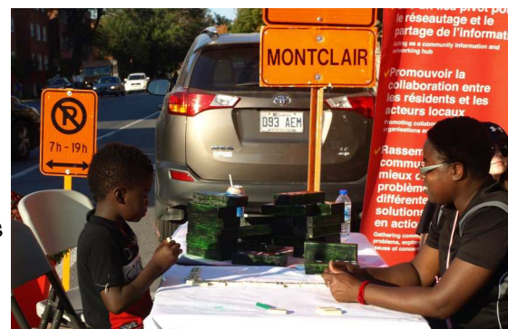
Parking Day 2017—Fielding-Walkley

Park(ing) Day is an international event designed to celebrate everyday choices for sustainable mobility and to advocate for favorable urban amenities by taking over a parking spot. Saint-Raymond, Benny and Walkley held their own eclectic version of parking day from coffee shops to hot dog stands to art and craft stations to a game of dominos! All gatherings were reflective of what residents wanted to see more of in the neighborhood. All three parking spots received a total of 150 residents in the area.