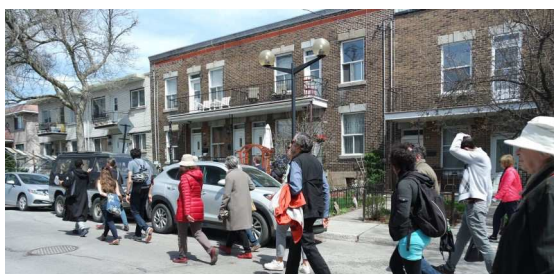
Jane’s Walk– St-Raymond

Each year, the NDG Community council host a number of neighborhood festivities in each priority sector. Key community actors and partners come together to organise an event for residents seeking to have a nice neighborly time. Residents look forward to these events as it offers multiple opportunities for community engagement throughout the year. In 2017, all four priority sectors held their own event, such as St-Raymond’s Harvest Festival, Benny Community BBQ, Westhaven Neighborhood Party - in conjunction with the Food Depot’s Good Food Picnic and Walkley’s neighborhood party . A total of 519 of residents were reached.