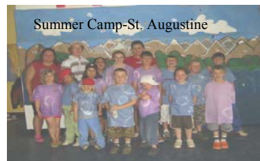
Summer Camp-St. Augustine