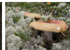
Just a few of the mushrooms found in the area