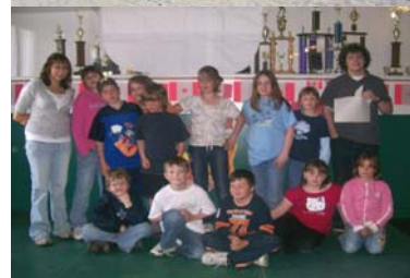
Summer Camp-Lourdes de Blanc Sablon