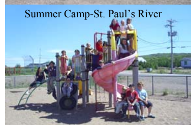
Summer Camp-St. Paul's River