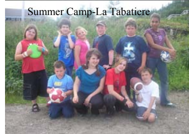
Summer Camp-La Tabatiere