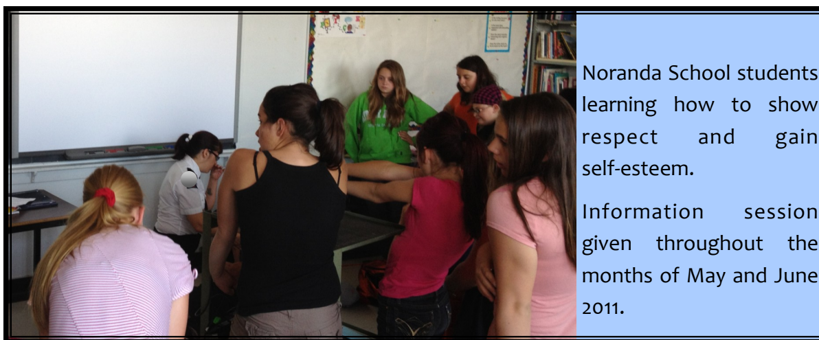
Noranda School students learning how to show respect and gain self-esteem.

Information session given throughout the months of May and June 2011.