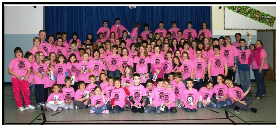
Pink shirt Day Campaign at Noranda School

Group picture of students from elementary and secondary